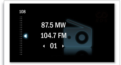
FM/MW (AM) stereo tuner