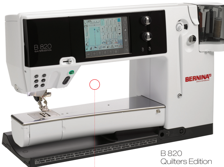
B 820 Quilters Edition

For optimal control and even fabric feed, whether piecing on the bias or working with hard to manage fabrics. When not in use, it tucks completely out of the way.