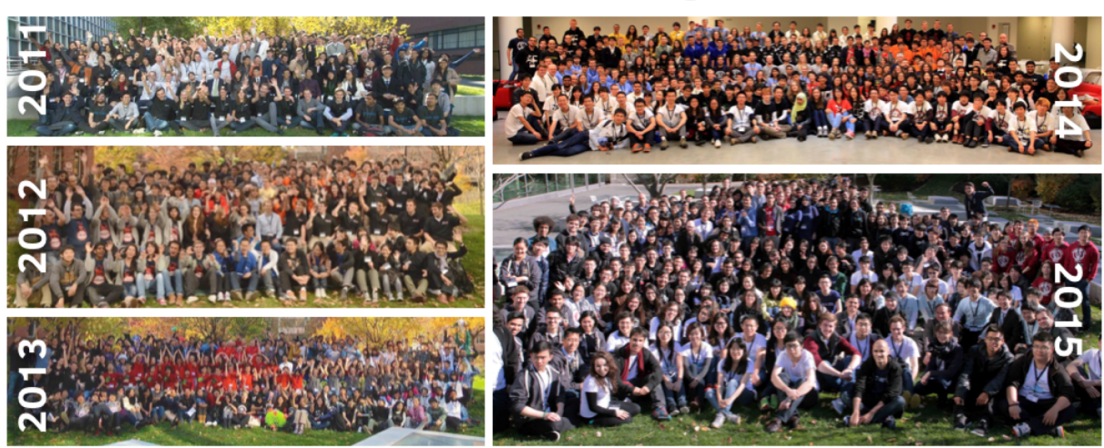
Over 1400 students, mentors, and judges have participated since 2011.

The BIOMOD competition was begun at Harvard University by the Wyss Institute for Biologically Inspired Engineering, which conducted the competition during the years 2011 to 2015. The mission of the competition was to inspire a generation of students to learn to engineer biomolecules at the nanometer scale. In 2016, BIOMOD Foundation assumed management of the competition.