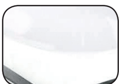
Replaceable high-hygiene polystyrene tray.