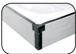
Cushioned safety corner.