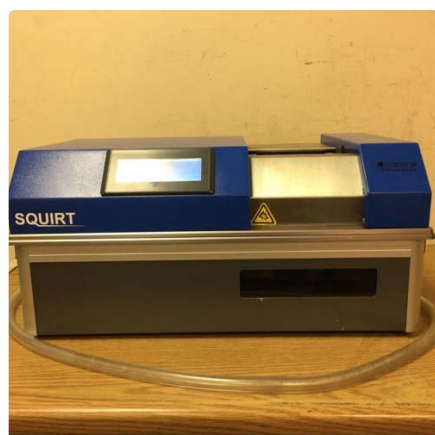
Matrical / Brooks Life Science Squirt SQT-500 Multi-Format Microplate Washer