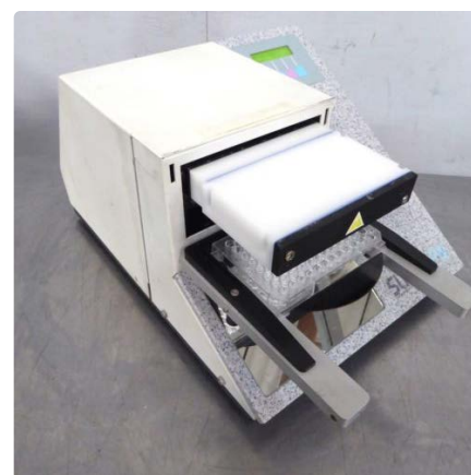
S132201 Tecan SLT Lab Instruments 96 PW Digital Microplate Washer PW96 96PW