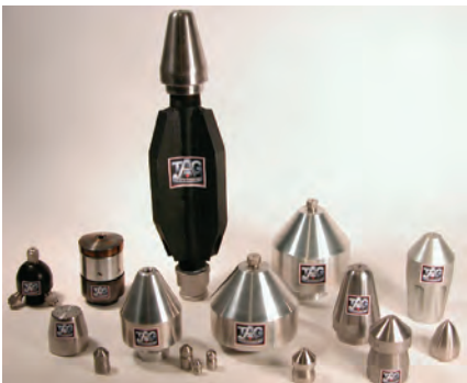
TAG Sewer-de-icing Nozzles Different models available