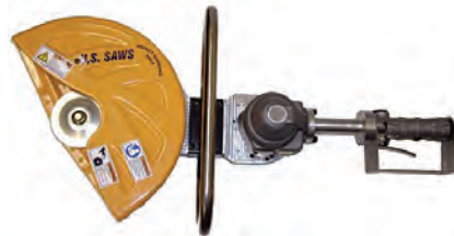
Hand-Held Pneumatic and Hydraulic Chop Saw 14"