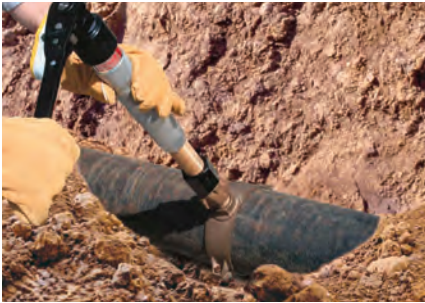
Tapping and Drilling Machines Different models available