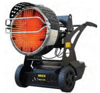
Portable Infrared Heater