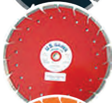
All Purpose Blade