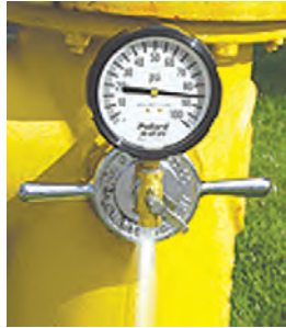
Fire Hydrant Gauge with Bleeder Valve