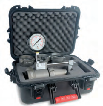
Flow Test Kit with Interchangeable Nozzles