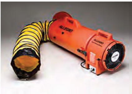
ALLEGRO SAL9533 Manhole Ventilator