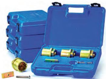
Valve Key Socket Set