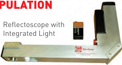
Reflectoscope with Integrated Light