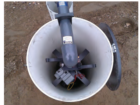
Easy access to controller