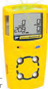
MicroClip XL Multi-gas Detector