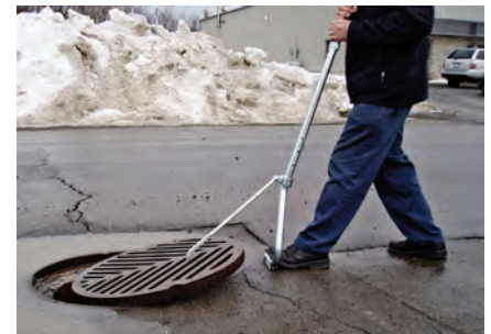
PROTO LIFT Storm Drain Cover Lifter