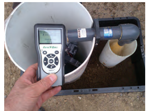
Data transfer via infrared