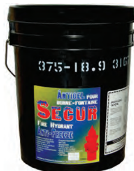
Non-Toxic Hydrant Antifreeze