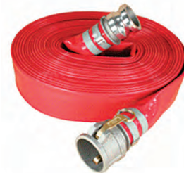
Discharge Flushing Hose