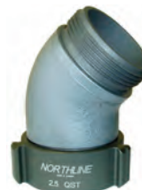
Elbows 45° or 90°