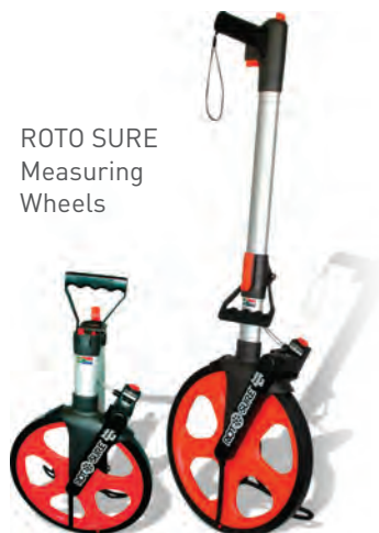
ROTO SURE Measuring Wheels