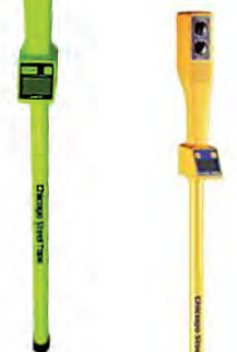
MAGNA-TRAK Model 100