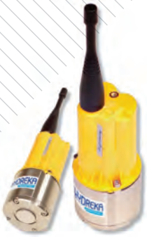
PERMALOG Noise Logger