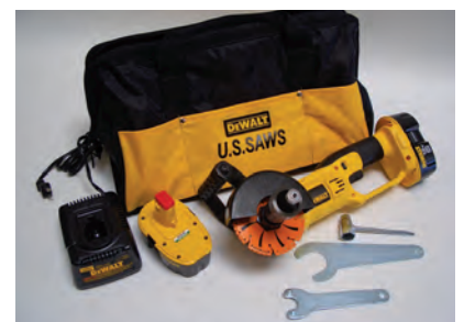
SEWER BUDDY Cutter and Beveller