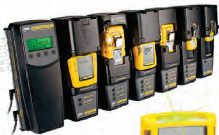
MICRODOCK II Calibration Docking System