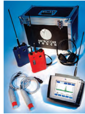
MICROCORR TOUCH Correlator