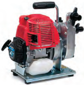
WX-10 Gas Pump