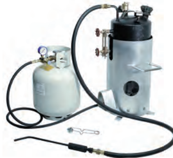
Portable Steam Thawer