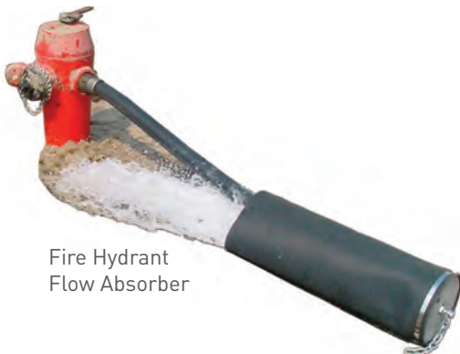
Fire Hydrant Flow Absorber