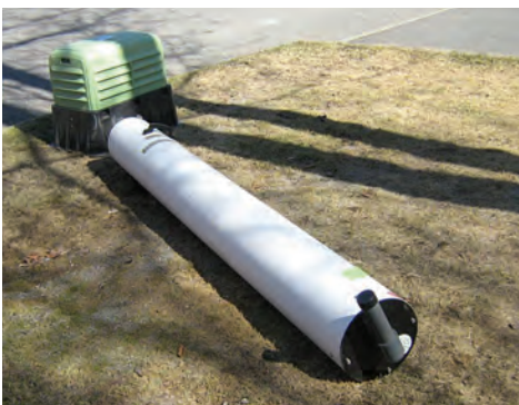
Model HG-4 - The components