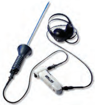
LMIC Acoustic Leak Detector