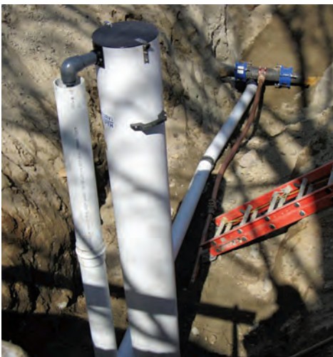
HG-4 Typical installation