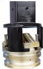
Hydrant Main Valve Seat Removal Tool