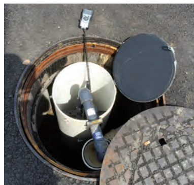
HG-4 Installation manhole head