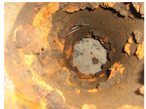
Eliminates water pipe clogging, Hydro-Guard can help you!