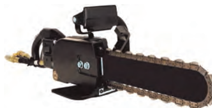
Gas, Hydraulic or Pneumatic Chain Saw