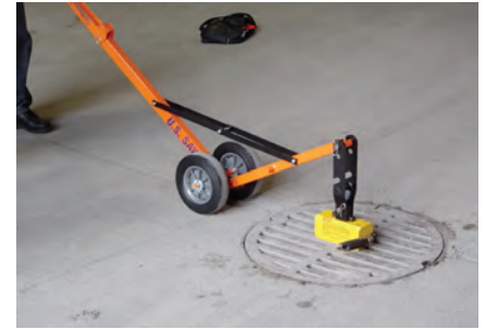
Magnetic Manhole Lifting System Different models available