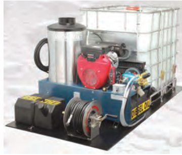
Special Design Pressure Washer

DIFFERENT MODELS AVAILABLE: ELECTRIC, GAS OR DIESEL