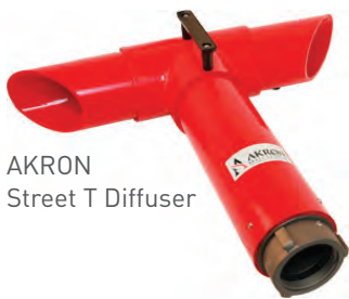
AKRON Street T Diffuser