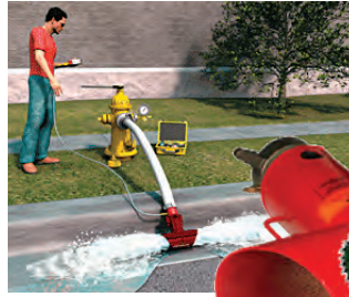
Flow Testing and Flushing HOSE MONSTER