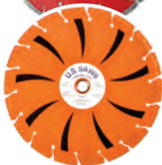
TIGERTOOTH Blade Cuts ductile and Cast iron pipe, PVC, Clay, Pipe and Rebar, Angle iron, etc.