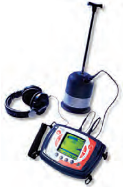
XMIC Advanced Electronic Acoustic Leak Detector