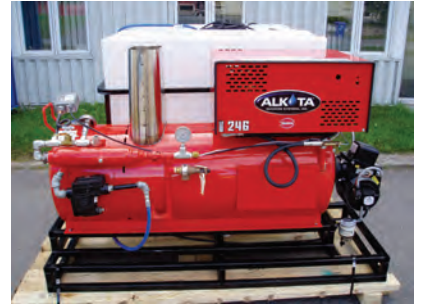
Dry Steam Generator Skid Mounted