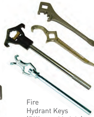
Fire Hydrant Keys (Different Models)