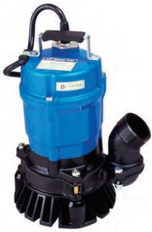
Submersible Pumps Different models available