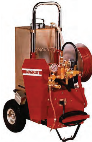
MAGIKIST Line Thawer