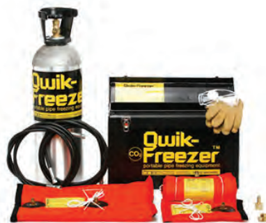
QWIK-FREEZER Pipe Freezing Equipment