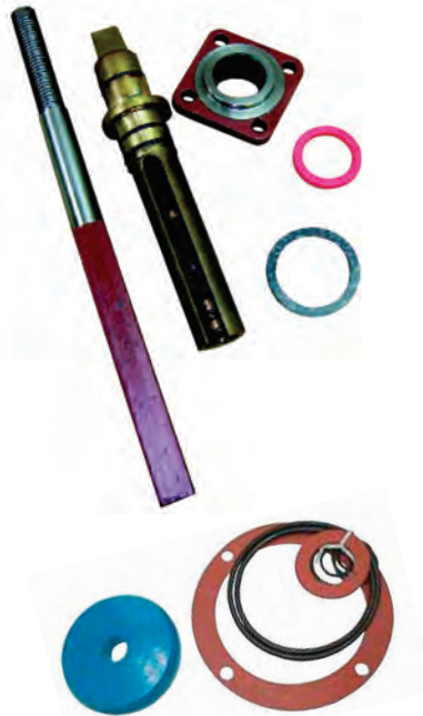
Restoration Gasket Kits