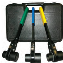
Double Socket Ratchet Wrench Set