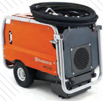
HUSQVARNA PP-518 Variable Flow Hydraulic unit

DIFFERENT MODELS AVAILABLE: ELECTRIC, GAS OR DIESEL