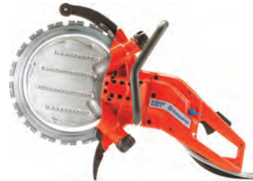
RING SAW K3600 MKII Hydraulic Powered Ring Saw