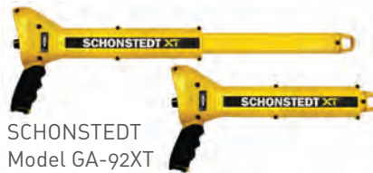
SCHONSTEDT Model GA-92XT