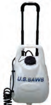
Tank 5 gallons