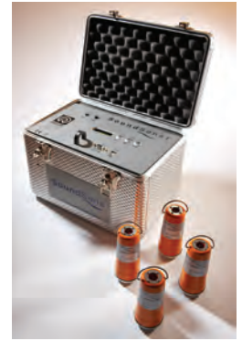
SOUNDSSENS Correlator Noise Logger