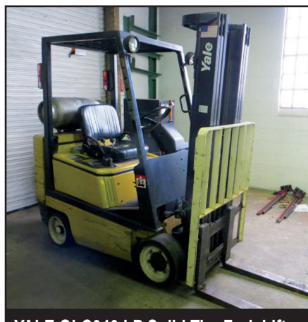
YALE GLC040 LP Solid Tire Fork Lift (Reff'd)