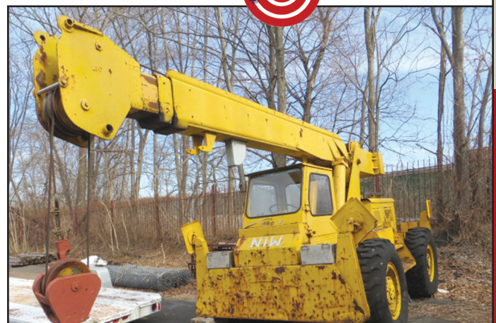
GROVE RT 49 Hydraulic Rough Terrain Crane