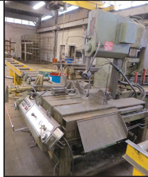
DOALL TF-14HA Hydraulic Tilt-Frame Vertical Band Saw

• NOTCHERS • DIRO mdl. 50 Tube Notcher, 2-3/4" T-Joint 90° x 14" Swing, 2-1/4" Stroke, 100 SPM • LINDERS Pipe Coper, s/n 833