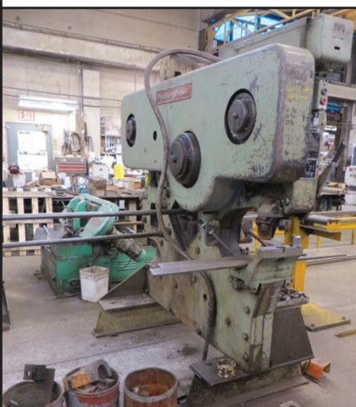
PEDDINGHAUS 210A/20 Iron Worker