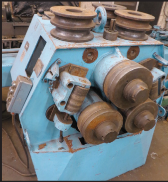
AMERICAN PULLMAX Z31 Angle Rolls

All other C & E Fabrication assets will be sold at the LIVE & ONLINE sale at Northern Iron Works on 4/22 with Inspection on Monday, April 21st from 9:00AM to 3:00PM at 2955 Franks Road, (Bethayres) Huntingdon Valley, PA 19006