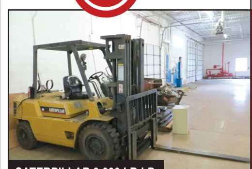
CATERPILLAR 9,000 LB LP Pneumatic Tire Fork Lift