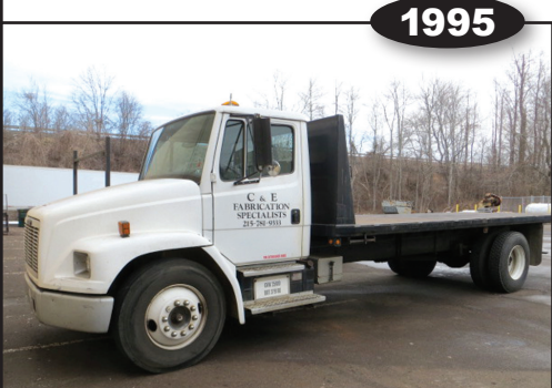
1995 FREIGHTLINER 22' Stakebody Truck