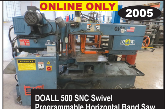
ONLINE ONLY DOALL 500 SNC Swivel Programmable Horizontal Band Saw

MILLER Syncrowave 350 Tig Welder w/DRO, s/n KA866531, Radiator Cooling System • MILLER ALT304 DC Inverter w/DRO, s/n LB110313 w/ XR-A Extended Reach Wire Feeder • MILLER Invision 354MP Mig Welder, s/n LC243638 • MILLER Shopmate 300DX Mig w/DRO w/MILLER 22A 24V Wire Feeder, s/n LB118084 • (2) MILLER MAXSTAR 200 & 140 Port. Migs., s/n LA264373