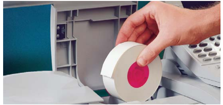
Drop-In Roll Tape – Self-adhesive roll tape is quick and easy to replace, and the system dispenses cut to size tapes to eliminate waste.