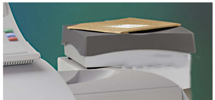
Weighing Platform Options – Configure the best system by choosing from the 5 lb. Integrated Platform, or you can consider the four remote platform options with maximum capacities of 15 lb., 30 lb., 70 lb., and 149 lbs.