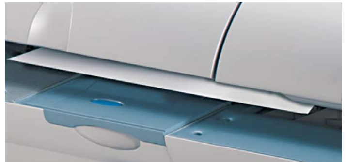
Secure Sealing – Tip-to-tip sealing secures the contents of the envelope. Pressure and transport rollers work together to provide a positive seal.