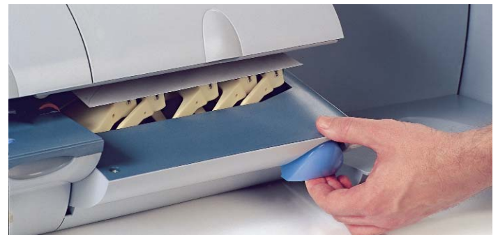
Drop Down Deck – Simplified access to the entire feed path ensures that your envelopes and contents are protected against damage.