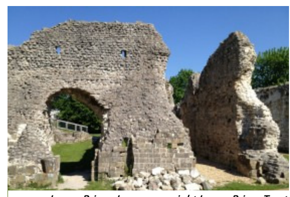
Lewes Priory.