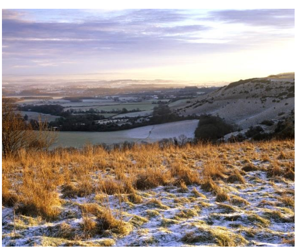
Ditchling Beacon.

You can also have a much longer walk if you want to. You could walk along the South Downs Way all the way to Devil's Dyke (see page 3). You can stop at Pycombe Church<sup>2</sup> to use the accessible toilets. They also welcome passers-by to use their tea and coffee making facilities!