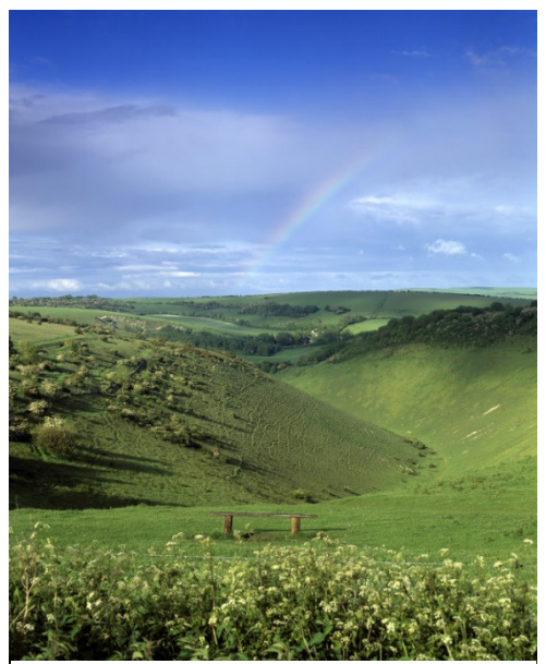
Devil's Dyke.

This bus runs every 45 minutes on Saturdays, Sundays and bank holidays, 9:45am – 6:45pm, late April to October. Sometimes this is an open top bus, which is a lot of fun!