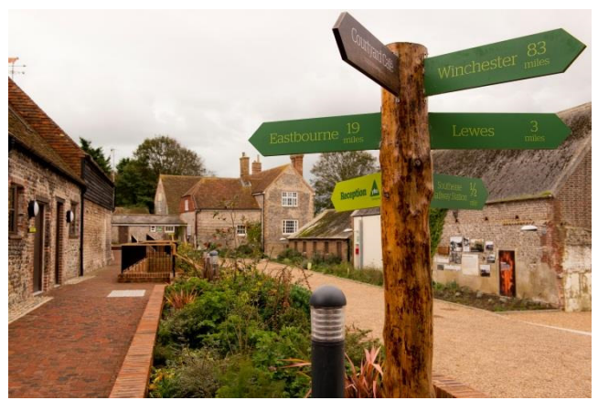
Southease Youth Hostel.