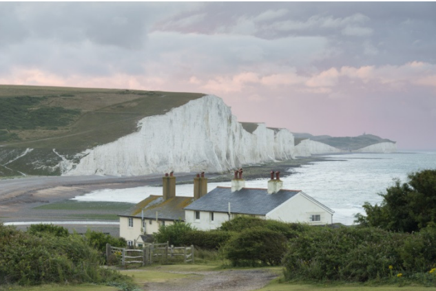
Cuckmere Valley.

There are also many other walks and tracks that start from Seven Sisters Visitors Centre. From here you can explore Friston Forest and the Cuckmere Valley. There are accessible toilets and a tea shop at the Visitors' Centre, which is very close to the bus stop.