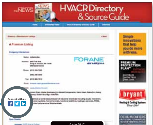
— SAMPLE — Social Media Links