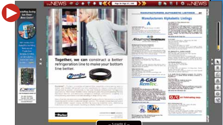
— SAMPLE — Skyscraper Ad