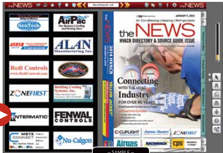
— SAMPLE — Sponsor Logos