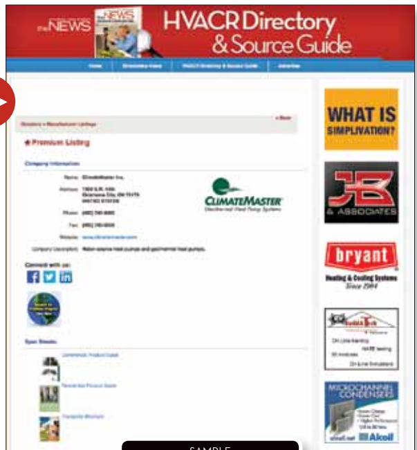
— SAMPLE — Online Premium Listing