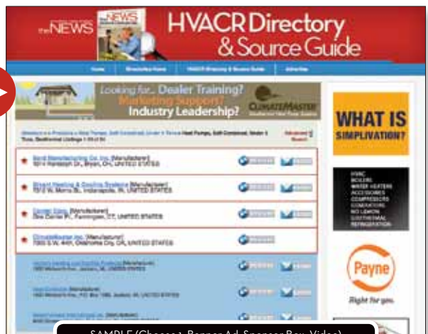
— SAMPLE (Choose 1: Banner Ad, Sponsor Box, Video) — Premium Plus with Banner Search