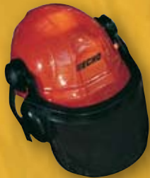
Helmet with Earmuffs Part #103942160

QuikVent™/Cut-Off Saw Steel Case Powder-coated, 18 gage steel case features 2 internal accessory compartments and fits all ECHO QuikVent and Cut-off Saw models. 31.5"L x 12.25"D x 16"H. Part #99944700191