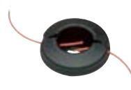
2-Line Rapid-Loader™ ECHO Head .095" dia. line Part #21560056