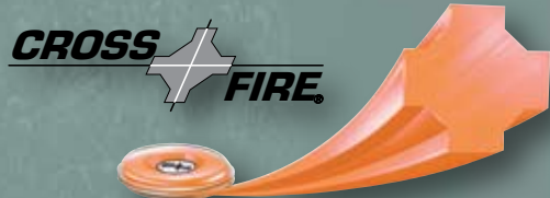
Cross-section of Cross-Fire® line shows the eight cutting edges which shear rather than tear grass.