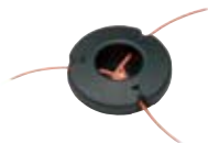
3-Line Rapid-Loader™ ECHO Head .095" dia. line Part #9994420021

Manual cutting heads use precut lengths of line that are inserted directly into the trimmer head.