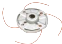
Heavy-Duty Fixed Line Head .130" dia. line Part #99944200220

Fixed cutting heads use line that is inserted into the trimmer head.