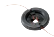
Rapid-Loader™ Universal Head .095" dia. line Part #21560059