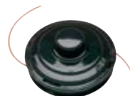
Dual-Line GT ECHOmatic® Head .080" dia. line Part #99944200240 Pre-wound Replacement Spool Part #21500240