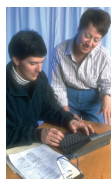
Your EnerGuide for Houses advisor will apply for the grant on your behalf.

You can expect to receive your cheque within 90 days of your follow-up evaluation.