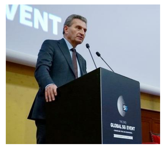
Figure 2: Commissioner Oettinger's speech at the "2<sup>nd</sup> Global 5G Event" in Rome

Furthermore, an exhibition (opened in parallel to the conference) with 24 booths was organised. The latest results and demos from 17 5G PPP Phase 1 projects were showcased there and networking among players from all over the world took place in a productive and dynamic atmosphere.