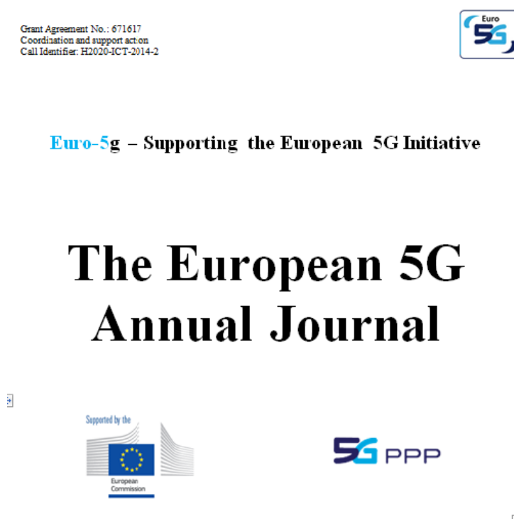
Figure 3: First electronic edition of the European 5G Annual Journal

The electronic version of the first edition was posted on the 5G PPP web site in July 2016 is presented hereafter: