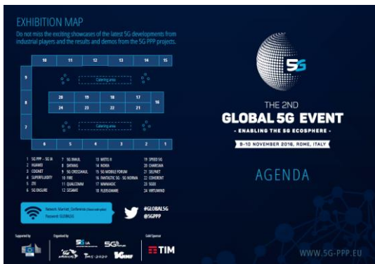
Figure 10: Agenda

Euro-5G designed and printed the event’s agenda.