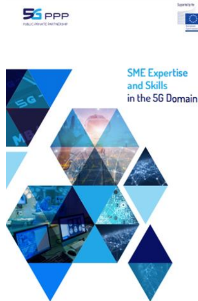
Figure 15: Cover Page of the SME brochure

Page 40: highlights from Bernard Barani (Deputy Head of Unit, DG CNECT, European Commission)