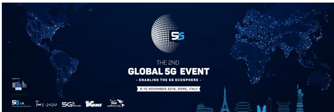
Figure 5: the 2 nd Global 5G event general design theme and logo

To start with, the “general design theme” and the event logo were designed. Both elements were designed in line with the 5G PPP look & feel, and in line with the “general design theme” produced for the 1st Global 5G event held in China.