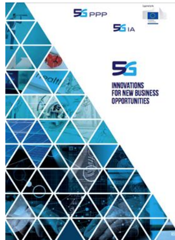
Figure 14 Brochure and flyer cover page

In addition, the brochures and flyers were also distributed at: