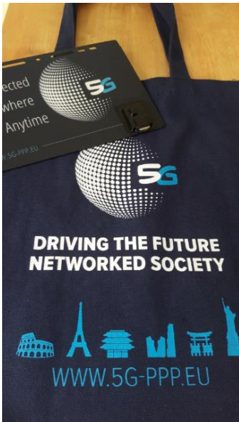
Figure 11: bag and solar charger