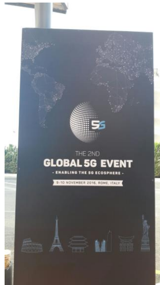
Figure 7 External banner and monolith