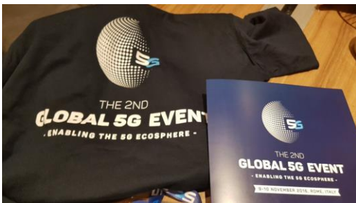
Figure 12: Volunteer's t-shirt and event's agenda