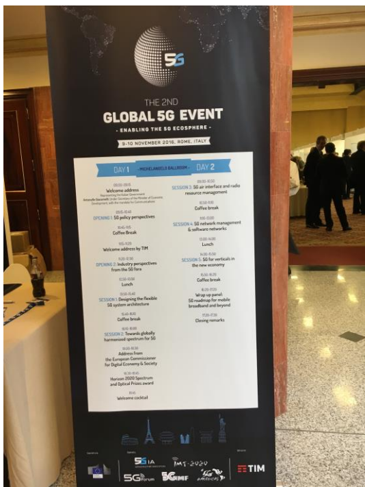
Figure 9: Roll-up