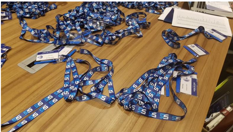
Figure 13: badges