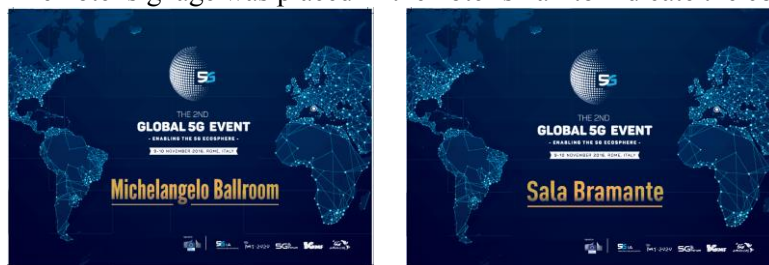
Figure 6: the 2 nd Global 5G event hotel signage

The hotel signage was placed in the hotel’s hall to indicate the conference’s rooms.