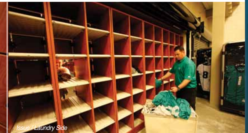
Issue / Laundry Side