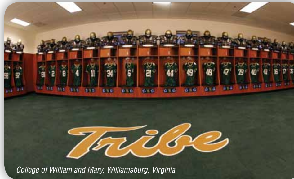
College of William and Mary, Williamsburg, Virginia