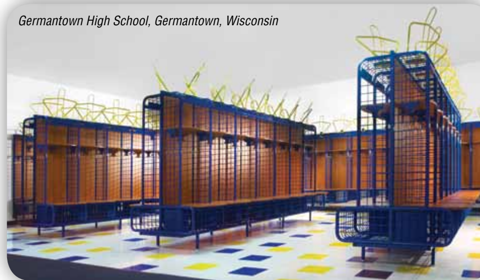
Germantown High School, Germantown, Wisconsin