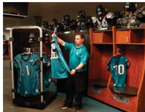
GEARBOSS® WOOD LOCKERS