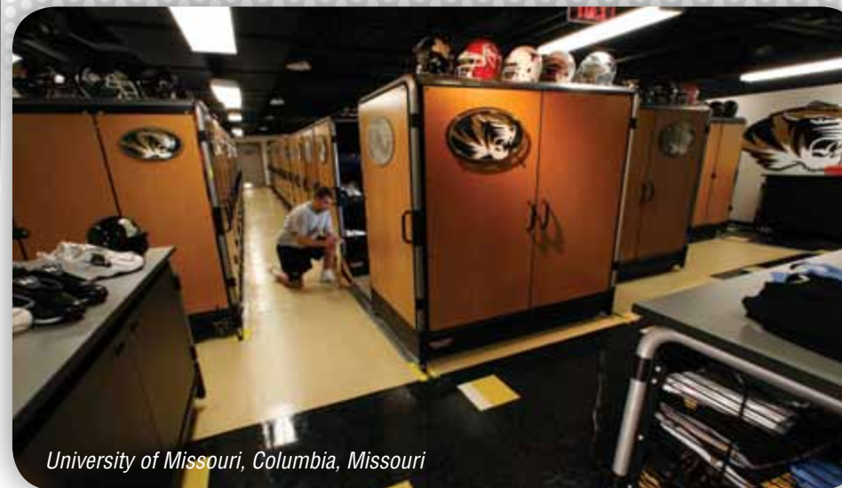
University of Missouri, Columbia, Missouri