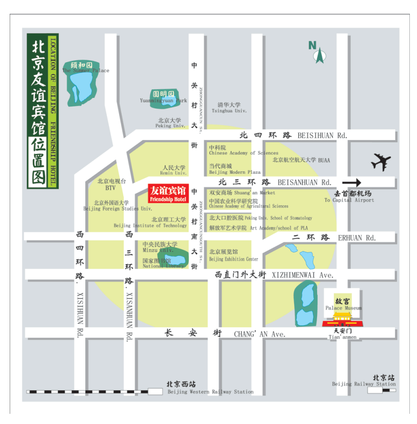
Figure 1: The location of Beijing Friendship Hotel in Beijing