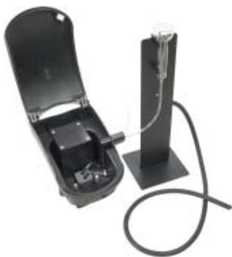
Pour-Thru Cell Kit