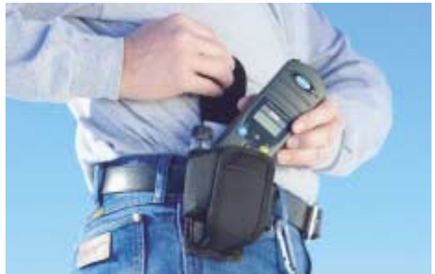
The optional soft-sided case/holster holds the Pocket Colorimeter, two vials, and reagents!