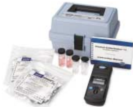
Each model comes as a test kit (shown above) with required sample cells, reagents, batteries, and manual.