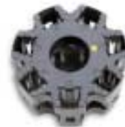
Carousel Sample Holder