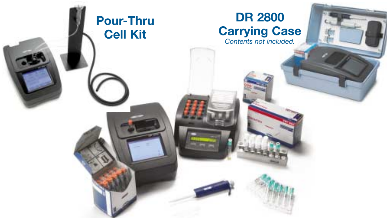
Pour-Thru Cell Kit