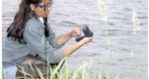
Rugged, portable, and convenient!