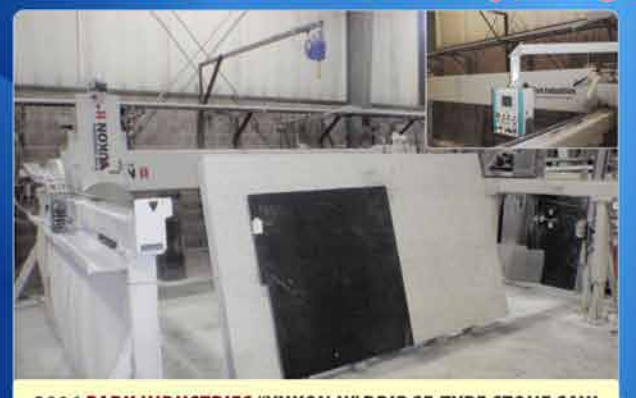
2006 PARK INDUSTRIES "YUKON II" BRIDGE-TYPE STONE SAW

Preview: Tuesday, August 7 ... 10:00am to 4:00pm