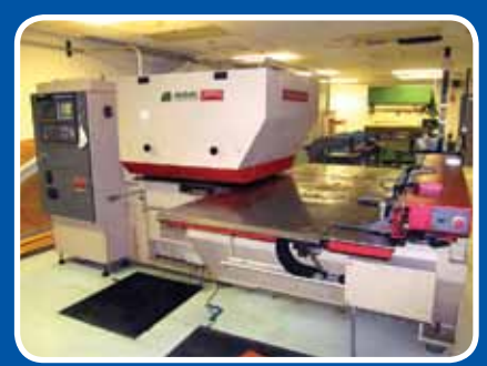
Murata Wiedemann Centrum 2000Q CNC Turret Punch