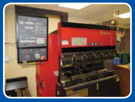
Amada FBD-3512 E 35 Ton x 48" Cap Press Brake