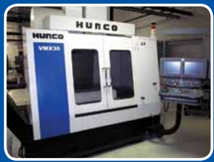
2008 Hurco VMX30 CNC Vertical Machining Center w/Hurco CNC Controls