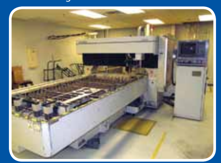
Mitsubishi 2512HD 2,000 Watt Max. Cap. Laser Cutting System