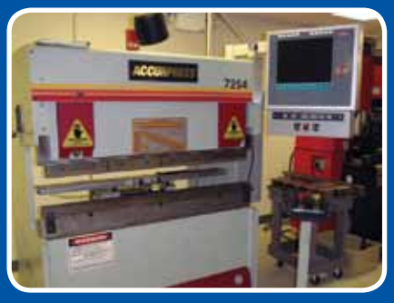
Accurpress 7254 25 Ton x 4' Cap. CNC Press Brake