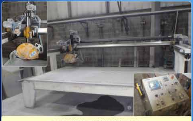
ACHILLI "SC-500SE" SLAB CART