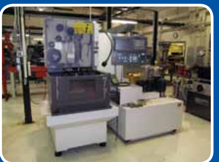
2000 Fanuc Robocut Alpha 0iA