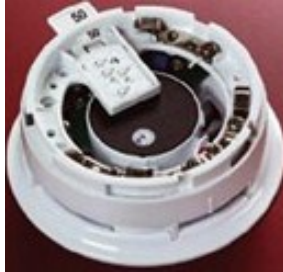
45681-276 Apollo XP95 Analogue Addressable Ancillary Sounder Base (does not require its own address) Part no LF2601-034

SEE PRICE LIST FOR MORE XP95 / DISCOVERY DEVICES