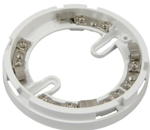
MKII-CB Fyreyeye MKII common diode base.