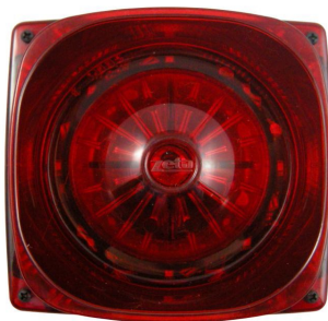
ZAMTF/R - Fyreye Extra Analogue Addressable Sounder / Beacon Red (suitable for indoor or outdoor use) Part no LF6000-017