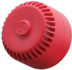
Red 24v Electronic Sounder Shallow Base