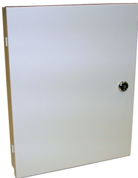
Document box holder (useful for storing manuals, logbook, drawings.