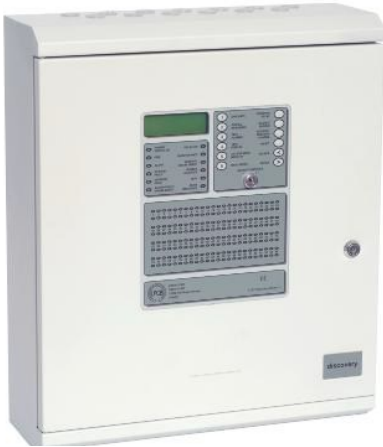
Discovery 1 loop Analogue Addressable Control Panel