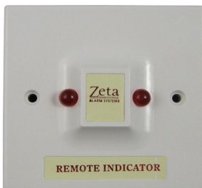
ZTA-LE2 Fyreye Extra Analogue Addressable Remote Indicator (addressed the same as the detector its connected to)