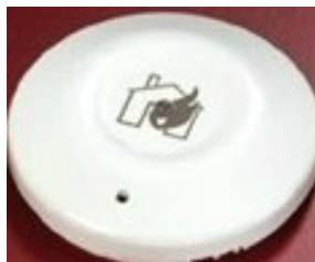
53832-70 Remote Indicator