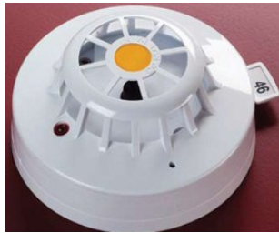
55000-400 Apollo XP95 Analogue Addressable Temperature Detector