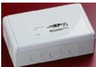
55000-875 Apollo XP95 Analogue Addressable Mains Input / Output Unit