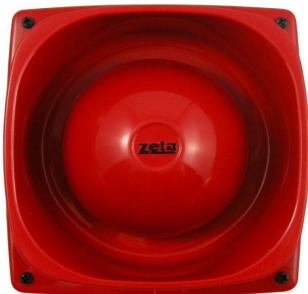
ZMT/8R Red Maxitone 24v Conventional Sounder