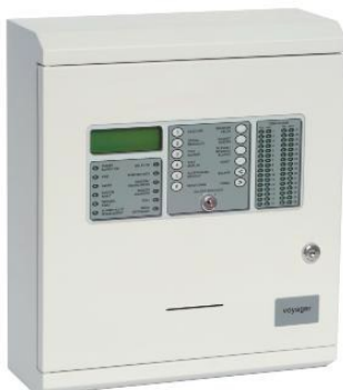
Voyager 1 loop Analogue Addressable Control Panel