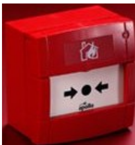
Conventional KAC call point with 680 ohm resistor and back box Part no LF2501-013

SEE PRICE LIST FOR MORE APOLLO CONVENTIONAL DEVICES