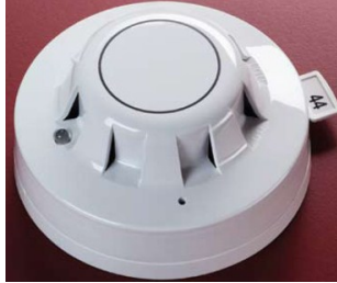
55000-600 Apollo XP95 Analogue Addressable Optical Detector

SEE PRICE LIST FOR MORE XP95 / DISCOVERY DEVICES