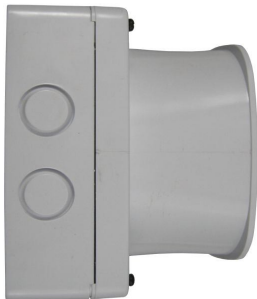
ZAMT/W - Fyreye Extra Analogue Addressable Sounder White (suitable for indoor or outdoor use) Part no LF6000-027