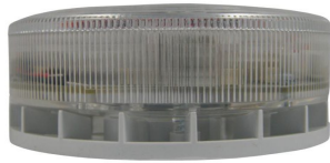
ZAS2/WFI - Fyreye Extra Analogue Addressable Sounder / Beacon Base With White Cap (requires detector base part number FE-CB / S for use with detector) Part no LF6000-026