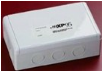
55000-841 Apollo XP95 Analogue Addressable Switch Monitor Plus