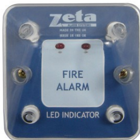
ZT-RL Conventional Remote Indicator