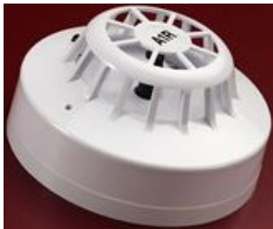
55000-137 Apollo S65 Conventional High Temperature Detector CS90 Part no LF2501-010