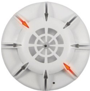
MKII-HR Fyreyeye MKII rate of rise and fixed heat detector