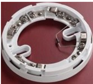
45681-20 Apollo S65 Conventional Diode Common Base Part no LF2501-003