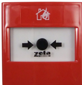
ZT-CP3 Conventional Call Point