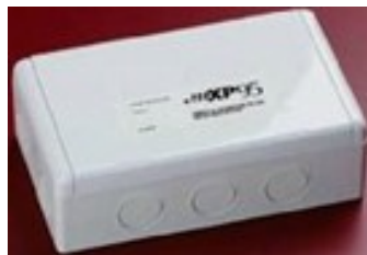
55000-847 Apollo XP95 Analogue Addressable Input / Output Unit