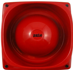
ZAMT/R - Fyreye Extra Analogue Addressable Sounder Red (suitable for indoor or outdoor use) Part no LF6000-016