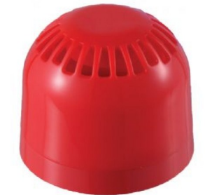
Red 24v Klaxon IP65 106dBA sounder deep base.