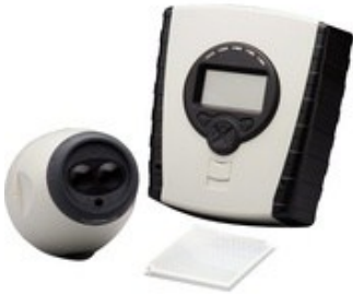
Fireray Beam Detector 50 metres