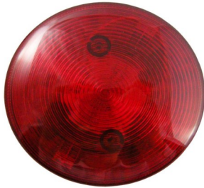
ZAS2/RFI - Fyreye Extra Analogue Addressable Sounder / Beacon Base with Red Cap (requires detector base part number FE-CB / S for use with detector) Part no LF6000-013