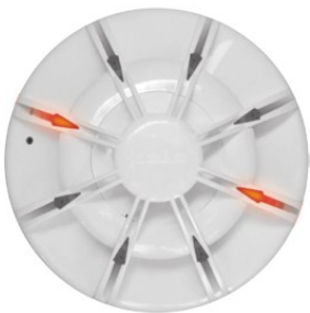
MKII-OH Fyreyeye MKII combined smoke and heat detector