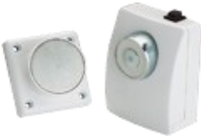
24v dc Magnetic door holder