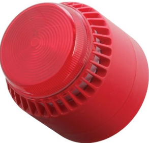
Red 24v Electronic Sounder Deep Base