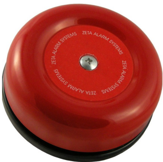
ZTB6B Fire Alarm Bell 6" 24v DC