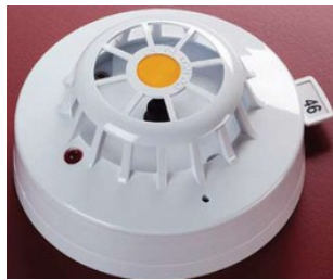
55000-401 Apollo XP95 Analogue Addressable High Temperature Detector