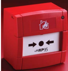
55100-908 Apollo XP95 Analogue Addressable Manual Call Point

SEE PRICE LIST FOR MORE XP95 / DISCOVERY DEVICES