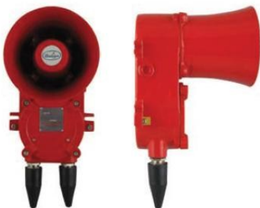
ZTSR/EXD24 Flame proof siren 24v dc