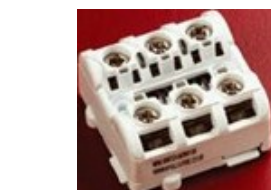
55000-760 Apollo XP95 Analogue Addressable Mini Switch Monitor Unit