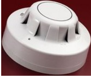
55000-317 Apollo S65 Conventional Optical Detector Part no LF2501-004