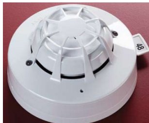
55000-885 Apollo XP95 Analogue Addressable Combined Temperature and Optical Detector