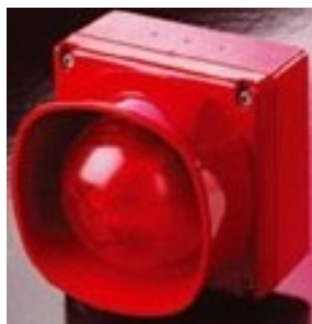
55000-298 Apollo XP95 Analogue Addressable Weatherproof Sounder / Beacon