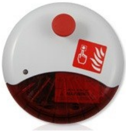
Push button temporary alarm