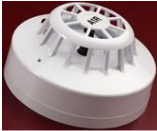
55000-122 Apollo S65 Conventional Temperature Detector A1R Part no LF2501-006