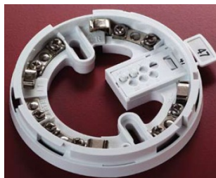
45681-210 Apollo XP95 Analogue Addressable Common Base