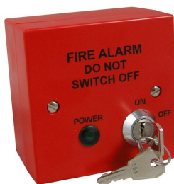
Fire alarm safety isolator switch