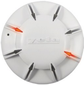
MKII-OP Fyreyeye MKII optical detector