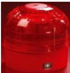
55000-005 Apollo XP95 Analogue Addressable Sounder / Beacon