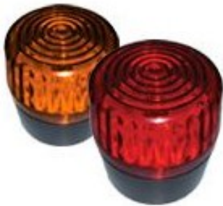
ZTSL6/R Red 24v Xenon Flashing Beacon