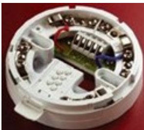
45681-284 Apollo XP95 Analogue Addressable Isolating Base Part no LF2501218