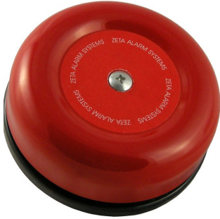
ZTB6B Fire Alarm Bell 6" 24v DC