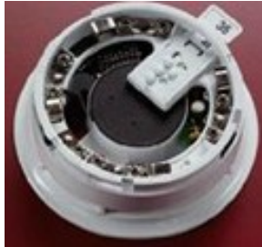
45681-277 Apollo XP95 Analogue Addressable Sounder Base (requires its own address) Part no LF2601-064