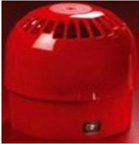
55000-001 Apollo XP95 Analogue Addressable Sounder