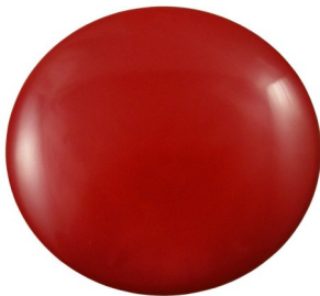
45681-293 Apollo XP95 Red Cap (for use with part numbers 45681-291 and 45681-330) Part no LF2601-068