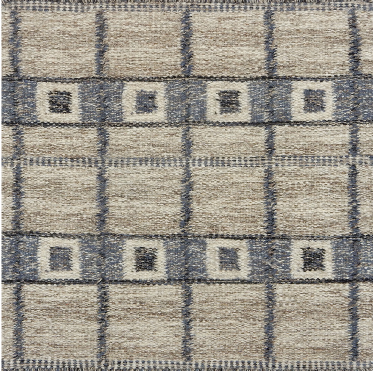
CULLERTON - SLATE