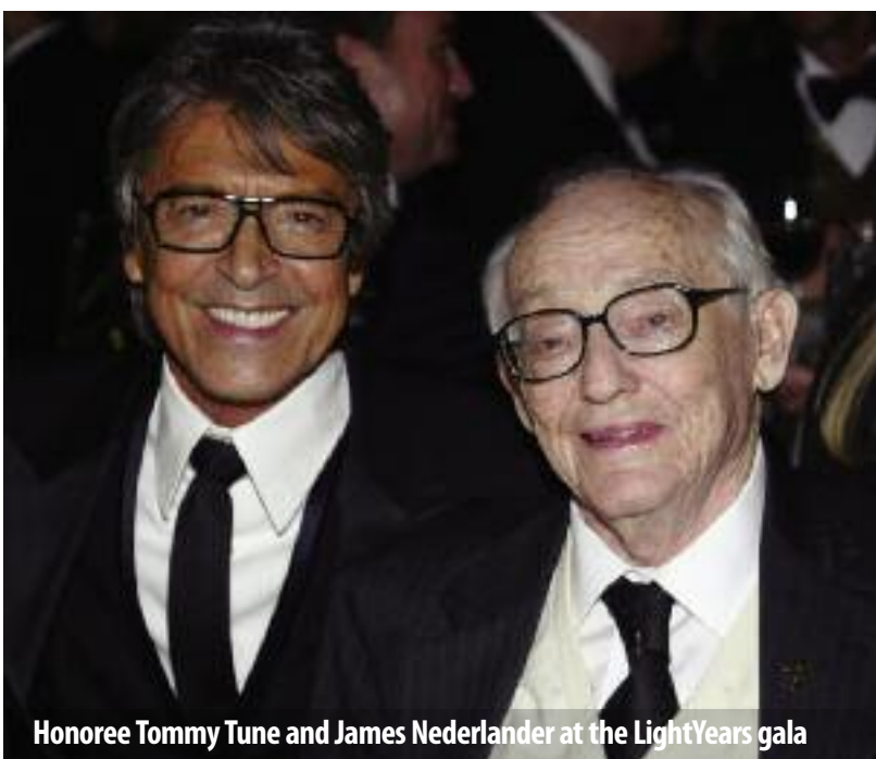
Honoree Tommy Tune and James Nederlander at the LightYears gala