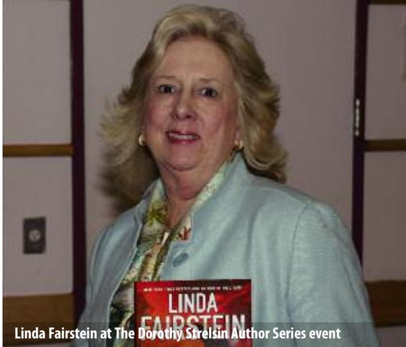
Linda Fairstein at The Dorothy Strelsin Author Series event