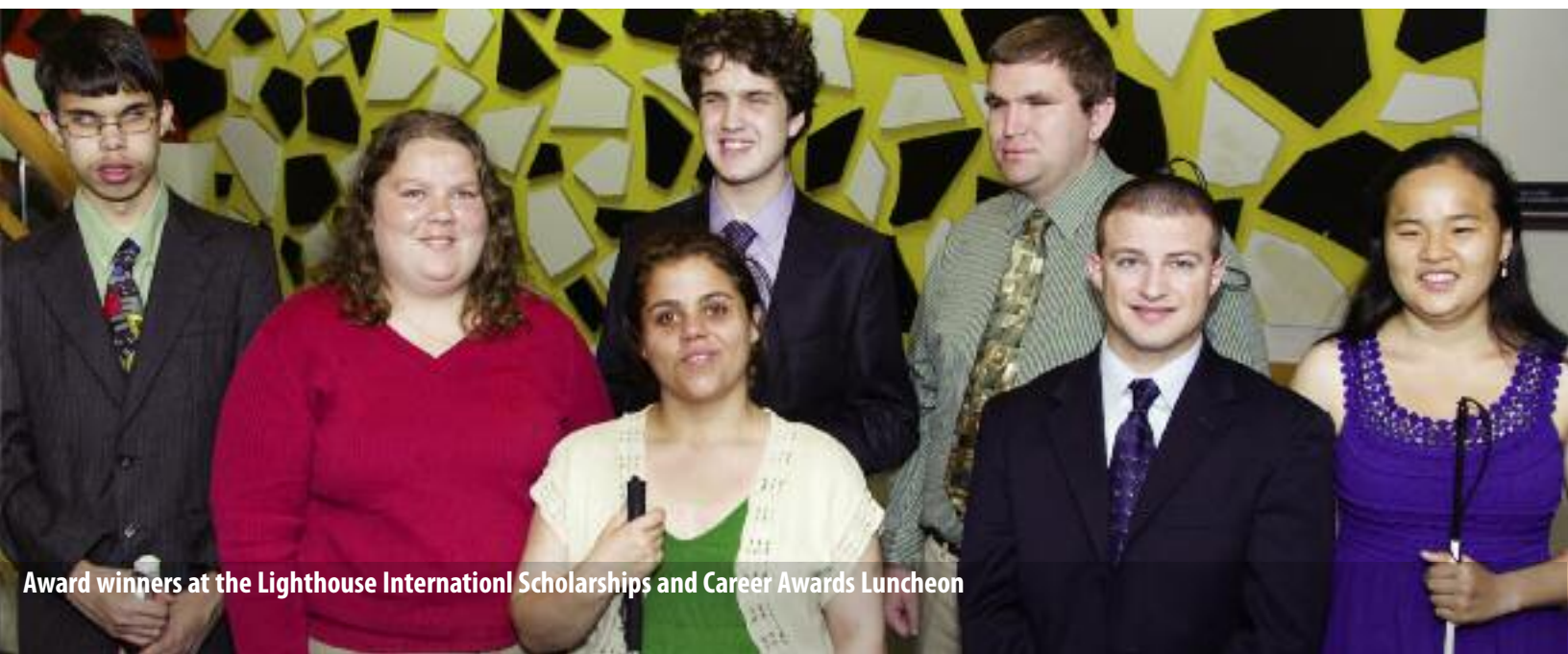
Award winners at the Lighthouse International Scholarships and Career Awards Luncheon