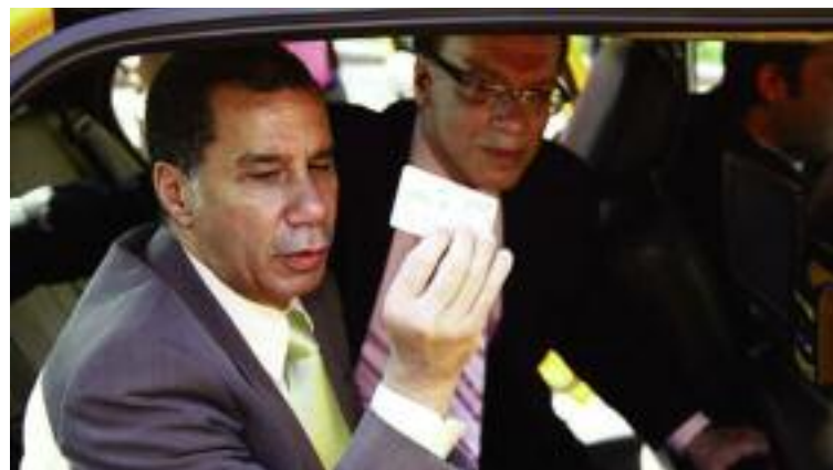
Former New York Governor David Paterson and Councilman Vacca demonstrate how to use the accessible taxi payment system.