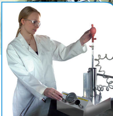
FAT Center, Tuusula, Finland