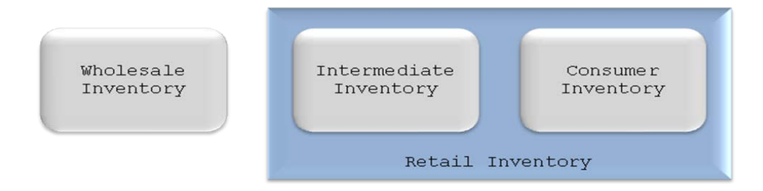
Figure 1-1.--Inventory Levels of Supply.

4. <u>Inventory Levels of Supply</u>. There are two major inventory levels of supply within the Marine Corps: wholesale and retail.