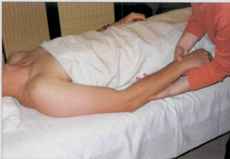
By using slight hand pressure, the massage-therapist moves lymph fluid collected under the client's skin.

Manual lymph drainage is not restricted to treating lymphedema; it can be used to treat sluggish lymph