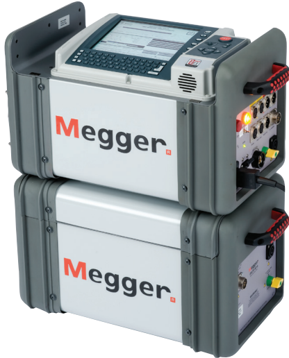
DELTA4310 test set shown above with onboard computer