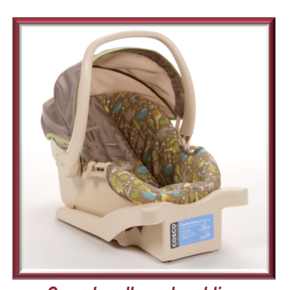
Carry handle and padding