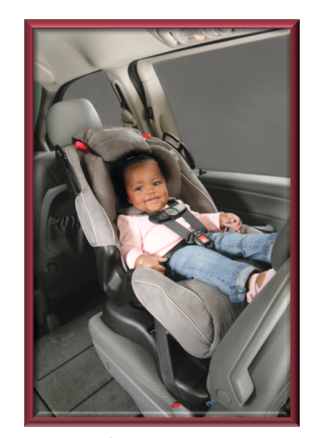
Rear-facing car seat

Go to <a href="http://www.safercar.gov/parents/carseats">http://www.safercar.gov/parents/carseats</a> to download NHTSA's car seat and booster seat recommendations flyer.