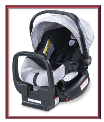
Foot prop/load leg and anti-rebound bar