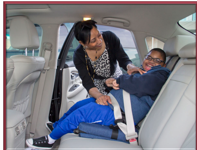
Special needs car seat

Some conditions resulting in special transportation needs may not be long-term or chronic. Children may have short-term or acute conditions such as a broken leg.