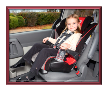
Forward-facing car seat