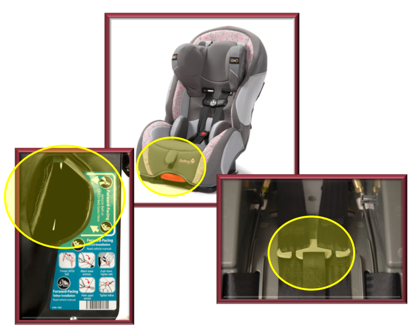
Belt path, recline adjuster, and splitter plate