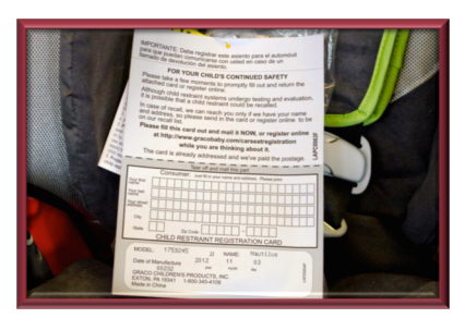
Car seat registration card