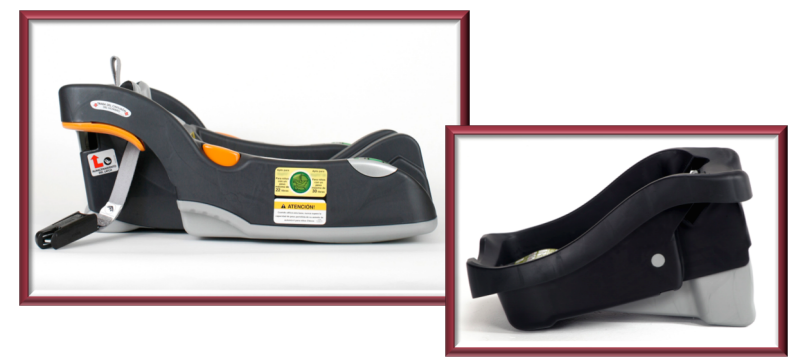
Detachable base and adjustment foot