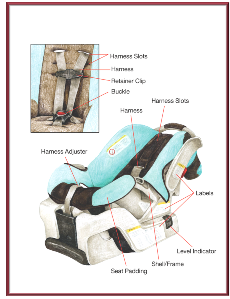
Parts of a seat