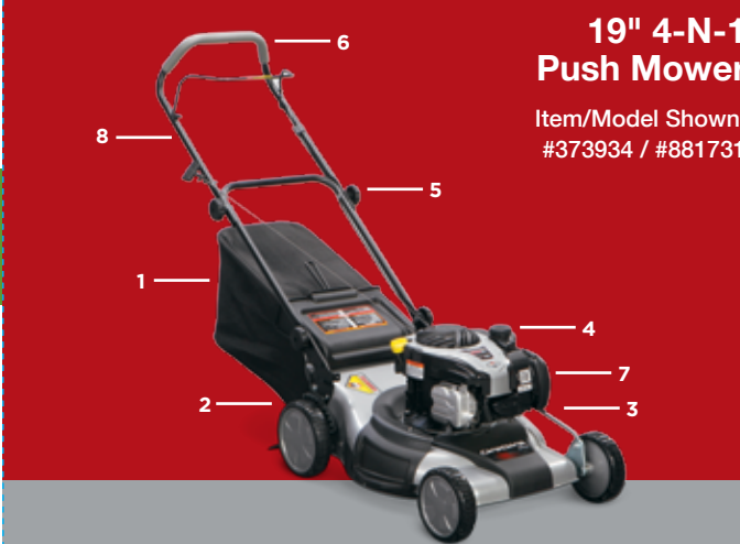
19" 4-N-1 Push Mower