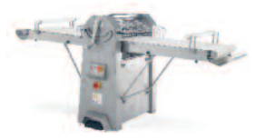
STAINLESS STEEL CONSTRUCTION LMA630