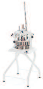
MDF820 (WITH OPTIONAL PDM001 STAND)