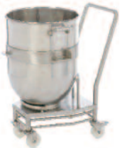
BTF080D BTF100D BTF120D BTF140D (Bowl sold separately)