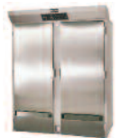
E236 (Shown with optional solid doors and optional door bumpers)