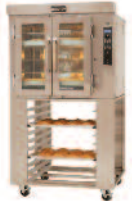
JA6 + Stand