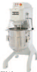
BTF060 BTFP60 (pizza) BTF060H BTFP60H (pizza)