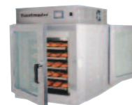
RA-5T (Shown with optional pass-thru)