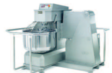
AB100XAI (STAINLESS STEEL)