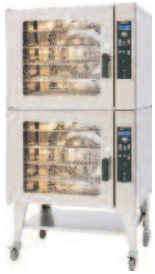
JA5P2618 (shown with optional stand)