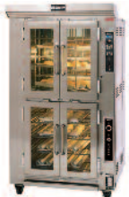
CA6 + Stand (Rotating)