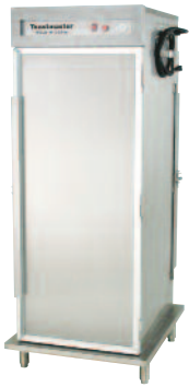
7500-H-UA13T (Shown with optional prison package)