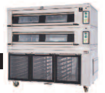
4T2 Shown with optional proofer