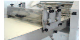
CROISSANT CUTTER LMA630 ONLY