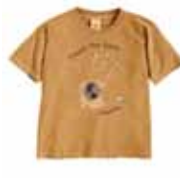
649-201-TER Touch the Earth