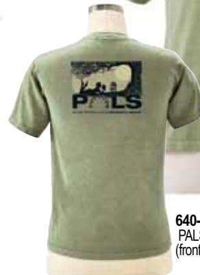
640-038-MOS PALS (front and back print)