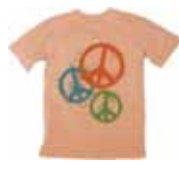
649-073-SUN Peace Paint