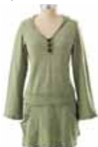
1156 Sadie Top