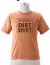
600-401-HEN Alabama Dirt Shirt

If you purchase any of the following additional popular designs from earth creations, at www.earthcreations.net , using code, PALS, 45% of those proceeds will go back to the children's dept. also. These make great holiday gifts!