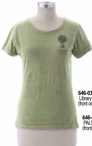
646-039-MOS Library in the Forest (front only print)