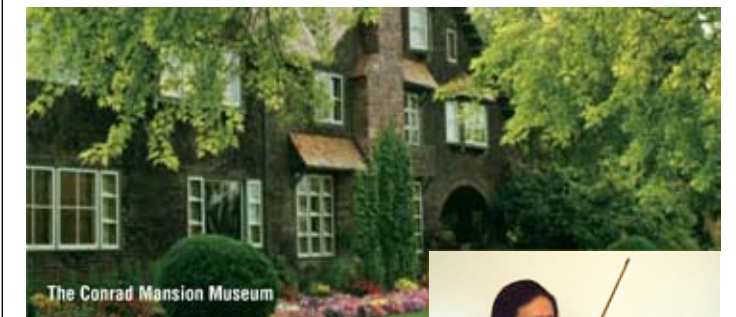
The Conrad Mansion Museum