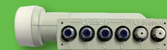
DStv Smart LNB