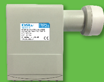
DStv Smart LNB