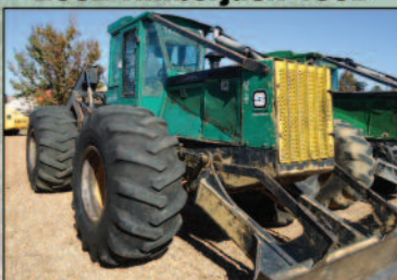
2002 Timberjack 460D