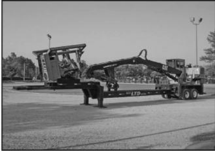
2006 Cat 559 Riley 4800C delimeter $105,000

Your Recycling & Forestry Used Equipment Source