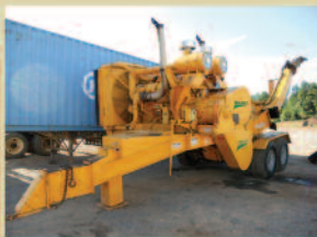
2008 Trelan 26RC - Call