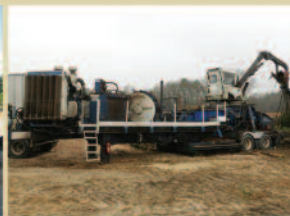
97 & 98 Peterson 5000G's

1996 Timberjack 460 Skidder, 30.5, Winch, 110 Esco, Unkn Hrs $24,900 2010 John Deere 753J Track Fellerbuncher w/FS22 w40 Deg Tilt, 840 hrs Call (2) 07 & 08 Tigercat 718/E Fellerbunchers, 20" HiCap Saw, 30.5 Tires, low hrs Call (2) 06 & 05 Tigercat 720D Fellerbuncher w5500 sawheads, 6000 hrs Call 2006 Tigercat 726D Fellerbuncher with 5600 sawhead, 28L Tires, 2700 hrs $99,500 2006 CAT 553 Fellerbuncher, 20" HiCap Saw, 28L Tires, 4900 hrs $92,500 2002 Timbco 445 Track Fellerbuncher, 22" Quadoo 360 Saw, 24" SG Pads $159,900 2000 Hydro-Ax 411EX with FECON BH120, 28L Tires $79,500 1998 Tigercat 720B w5500 Sawhead, 30.5 Tires, Recent Engine/Pump $39,500