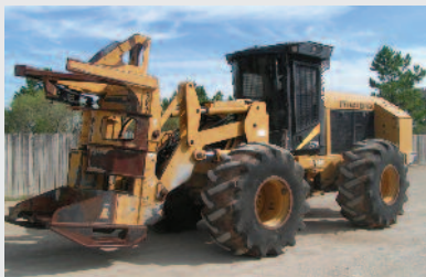
2006 Hydro-Ax 570 - 6,700 hours, 20" Hi Capacity Saw Head, "NEW" 28L tires, Cab with air.....$79,500