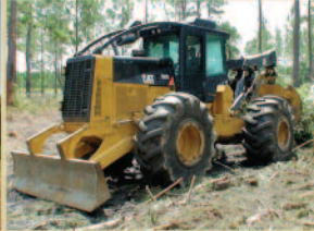
09 CAT 525C $142,500