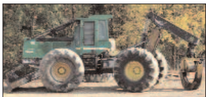
2006 John Deere 748GIII dual arch, 35.5x32 tires, ready to work .....$55,000 Video available on request

5700 Hwy 49E • Yazoo City, MS 39194 www.stricksequipment.com 662-746-8380