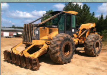
2001 Deere 648GII