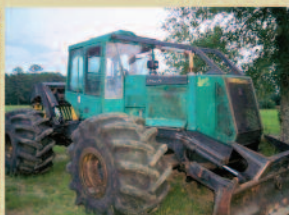
96 TJ 460, 34" Tires, ES 100"