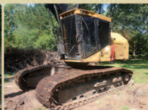
06 Tigercat S860C Low hrs

1993 Timbco 425B, 6BTA Cummins (fresh) 32 TGP, 30" Barsaw $32,900 2007 Tigercat 234 Knuckleboom Loader, CSI 264, 53" Grapple, 9000 hrs Call 2005 Tigercat 240B Knuckleboom Loader, CSI 143, 53" Grapple $39,500 2005 Timberking 575DK TMS Loader, CTR 450, 55" Grapple, 3400 hrs $85,000 2008 Peterson 5900 Chipper, 3 Knife, Key System, 4400 Hrs, One Owner $289,500 2006 Woodsman 334 Chipper, New Drum Update, 974Hrs $126,500 2006 Trelan 23L Chipper, CAT 3412, 3-Knife, 1200 hrs $285,000 1998 Peterson 5000G, 990 hp, 3-Flail, 3-Knife, Excellent Condition Call 1997 Peterson 5000G, 850 hp, 2-Flail, 3-Knife, Good Condition $92,500 2002 CAT 525B/535B Bunching Grapple (ESCO 123") $5,900 Tigercat 5701 Sawhead, New Disc, Bearing & Shaft $12,400 CTR V-Bunk and Flat Bunk, Extended and Reversible Ground Saws Call