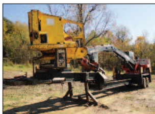
2005 Prentice 384, CSI delimeter .....$45,000