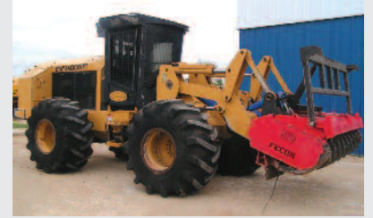
2005 Timberking TK360 Mulcher - Fecon 9021 Mulching Head, 28L tires, Cab with air, Cat engine .....$169,500