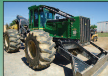
2006 Deere 648GIII