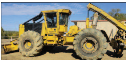
2005 Tigercat 620C, dual arch, tigh machine .....$45,000