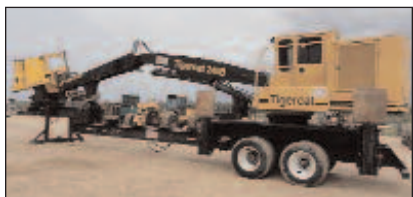
2005 Tigercat 240B, CSI delimeter, super nice! .....$55,000 video available