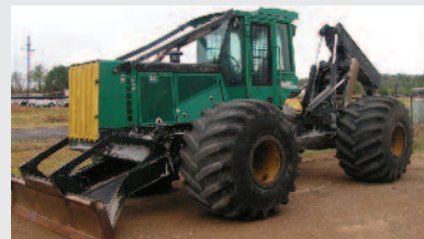
2006 Timberjack 460D Grapple Skidder - Dual arch, Winch, Cab with air, 43" Flotation tires ..$79,500