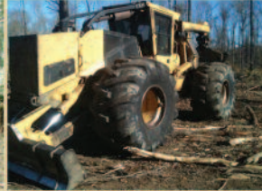
07 CAT 630C wFresh Stats

2009 CAT 525C DA Skidder wWinch, Grapple, 3900 hrs, Very Nice $142,500 2007 Tigercat 620C Dual Arch Skidder, Grapple, Winch, 30.5 Tires, 7000 hrs Call 2007 CAT 535C Dual Arch Skidder, Grapple, Winch, 30.5 Tires, 5100 hrs $129,500 2007 CAT 545C DA Skidder, Grapple, Winch, 30.5 tires, 5900 hrs Call 2007 Tigercat 630C Skidder, Grapple, Winch, 35.5 Tires, Fresh Stats $59,900 2006 CAT 545 DA Skidder, Grapple, Winch, 35.5 Tires, 5200 hrs $125,000 2005 Prentice 490 Single Arch Skidder, Grapple, Winch, 30.5 Tires, 5320 hrs $45,900 2003 & 04 Deere 648GIII, Single Arch, Grapple, Winch, 30.5 Tires Call 1999 CAT 517 Track Cable Skidder, OROPS, New Undercarriage, 3700 hrs $114,900 1996 CAT 515 Cable Skidder, 23.1 Tires, 7100 Hours, Excellent Condition! $44,900