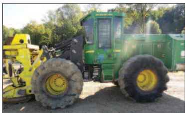
2006 John Deere 643J, FD 45 head, 28Lx26 tires, ready for the woods! .....$65,000