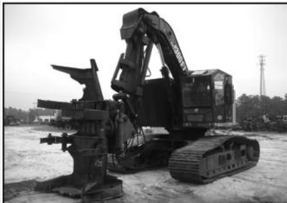
2004 Timberking 721B $119,000

We also BUY Used Recycling & Forestry Equipment