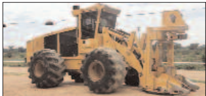
2005 Tigercat 724D, 8557 hours, 5500 head, nice cutter .....$65,000