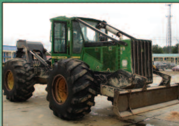
2006 Deere 648GIII