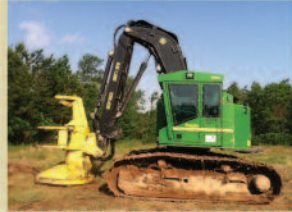
2010 JD 753J w840 hrs - Call

Brian Nielson (Cell) 803.960.1613 | Jesse Sewell (Cell) 803.807.1726