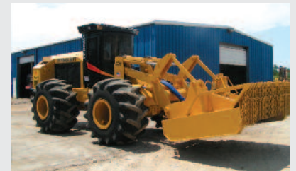
2002 HydroAx 570 Mulcher - Rotary Ax Mulching Head, Cummins engine, 34:00 tires, Cab with air