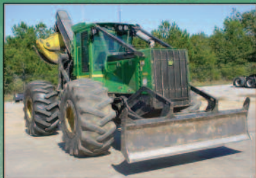
2010 Deere 748H