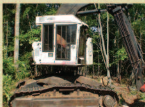
02 TI 445D w22" Saw, Nice!

1996 Timberjack 460 Skidder, 30.5, Winch, 110 Esco, Unkn Hrs $24,900 2010 John Deere 753J Track Fellerbuncher w/FS22 w40 Deg Tilt, 840 hrs Call (2) 07 & 08 Tigercat 718/E Fellerbunchers, 20" HiCap Saw, 30.5 Tires, low hrs Call (2) 06 & 05 Tigercat 720D Fellerbuncher w5500 sawheads, 6000 hrs Call 2006 Tigercat 726D Fellerbuncher with 5600 sawhead, 28L Tires, 2700 hrs $99,500 2006 CAT 553 Fellerbuncher, 20" HiCap Saw, 28L Tires, 4900 hrs $92,500 2002 Timbco 445 Track Fellerbuncher, 22" Quadoo 360 Saw, 24" SG Pads $159,900 2000 Hydro-Ax 411EX with FECON BH120, 28L Tires $79,500 1998 Tigercat 720B w5500 Sawhead, 30.5 Tires, Recent Engine/Pump $39,500