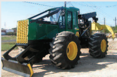
2003 Timberjack 460D Grapple Skidder - Dual arch, Winch, Cab with air, 30.5 x 32 tires.....$59,500