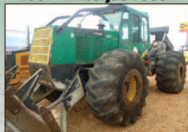
2001 Timberjack 660D