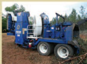
08 Peterson 5900 w4500 hrs

2009 CAT 525C DA Skidder wWinch, Grapple, 3900 hrs, Very Nice $142,500 2007 Tigercat 620C Dual Arch Skidder, Grapple, Winch, 30.5 Tires, 7000 hrs Call 2007 CAT 535C Dual Arch Skidder, Grapple, Winch, 30.5 Tires, 5100 hrs $129,500 2007 CAT 545C DA Skidder, Grapple, Winch, 30.5 tires, 5900 hrs Call 2007 Tigercat 630C Skidder, Grapple, Winch, 35.5 Tires, Fresh Stats $59,900 2006 CAT 545 DA Skidder, Grapple, Winch, 35.5 Tires, 5200 hrs $125,000 2005 Prentice 490 Single Arch Skidder, Grapple, Winch, 30.5 Tires, 5320 hrs $45,900 2003 & 04 Deere 648GIII, Single Arch, Grapple, Winch, 30.5 Tires Call 1999 CAT 517 Track Cable Skidder, OROPS, New Undercarriage, 3700 hrs $114,900 1996 CAT 515 Cable Skidder, 23.1 Tires, 7100 Hours, Excellent Condition! $44,900