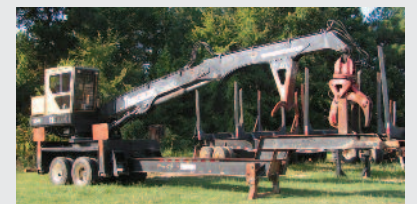
2004 Timberking TK540 / Prentice 280 Log Loader - 5,035 hours, Prentice continuous rotating grapple, Cab with air, Trailer mounted .....$49,500