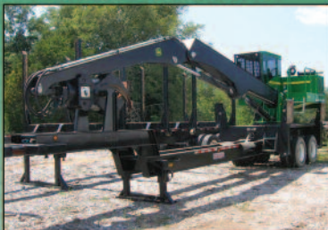
2008 Deere 437C