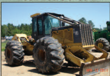
2002 Deere 648GIII