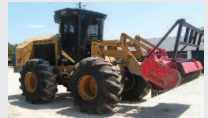
2004 Hydro-Ax 470 Mulcher - Fecon BH120 Mulching Head, New Cummins engine, 28L tires, Cab with air .....$119,500