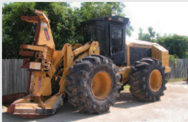
2007 Cat 573 Feller Buncher - 225 HP, Waratah FD22 Saw Head, very good 30. x 32 tires, cab with air. ....$CALL$