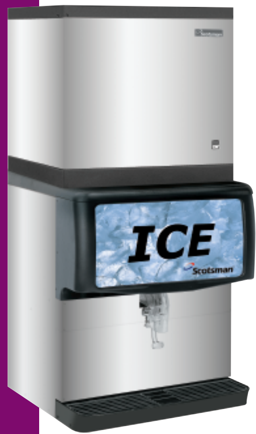
CME1056 on BD200

Scotsman ID & BD series dispensers provide durable, reliable performance under the most demanding conditions. Heavy-duty construction and components assures longer life. The insulated, heavy-duty drip tray prevents condensation that can leak on countertop causing damage and/or sanitary issues. Stainless steel exteriors provide an attractive and inviting contemporary design yet resist corrosion and rust. Designed to Scotsman's specifications, ID & BD dispensers are a perfect match for CM 3 cubers.