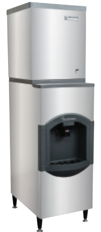
CME306 on HD22 Dispenser

Ⓜ Dispensers rated in accordance with ARI standards 820-95 Ⓜ Ice machines rated in accordance with ARI standard 810-95