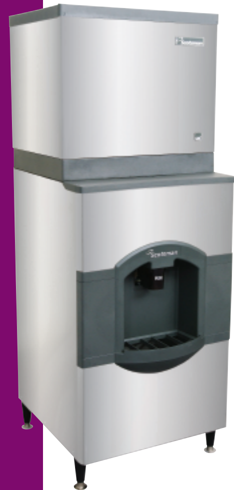
CME506 on HD30 Dispenser

Match the iceValet with Scotsman's CM 3 ice machines featuring Auto IQ™plus control system, the CM3 evaporator and a rust free polyethylene base and food zone that's backed by a lifetime rust free warranty. CM3 technology features ReliaClean™, a simplified, push button cleaning process, to help keep your ice machine clean. All these features add-up to offering the Lowest Lifetime Cost of Ownership.