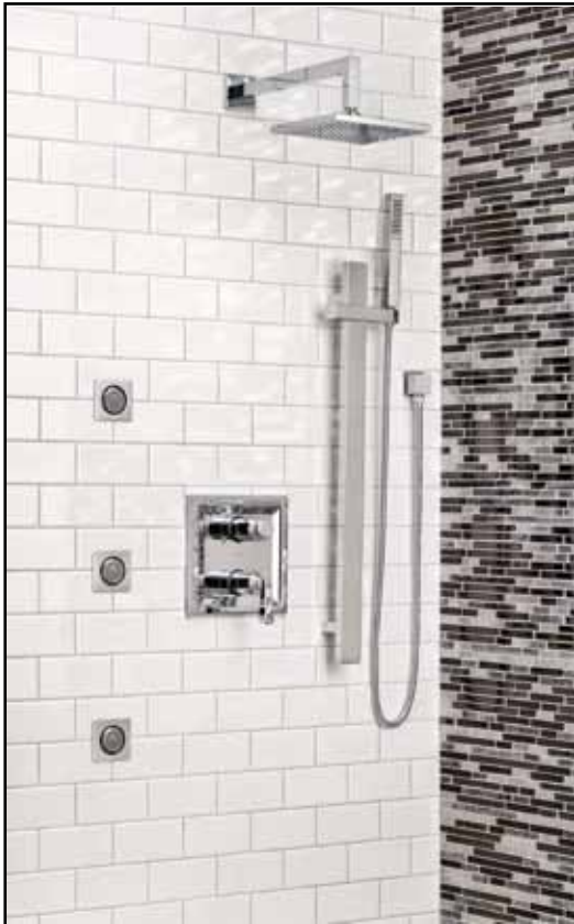
1662832 - Town Square Super Shower System Kit with Body Sprays