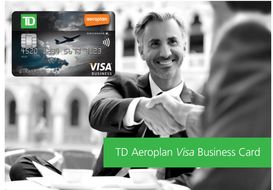
TD Aeroplan Visa Business Card

Outside Canada and the United States, call collect:.....416-308-3763