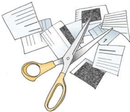
Figure 2: How Plagiarism Works (Weber-Wulff, 2004b)

Example of an image with the source cited in the references: