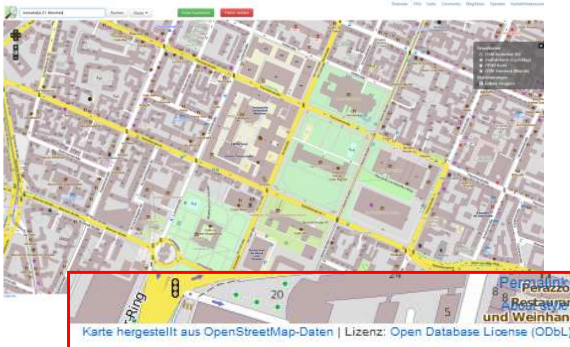
Map 1: Arcisstraße 21, Munich (Open Street Maps, 2016), published under Open Database License ODbL

If you use a lot of maps in your work, create a reference list of all the maps in your work.