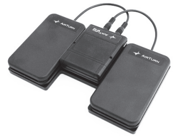
Hands-Free Page Turner