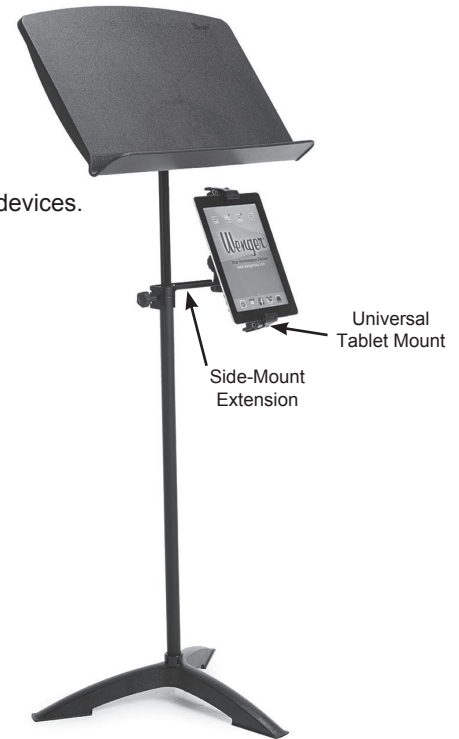
(shown on traditional music stand)