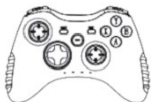
Game Controller X1