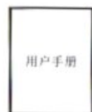
User Manual X1