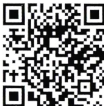
PC Driver download