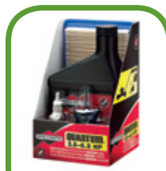
Tune-up Your Engine