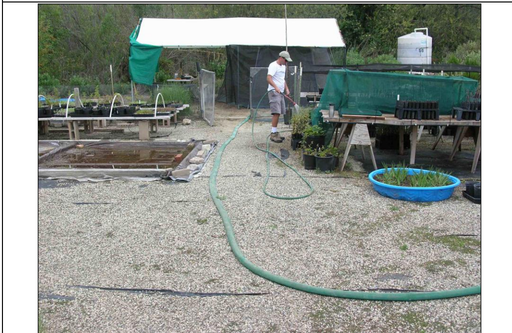
April 2011: Typical operations. Nursery has water tank, solar-powered irrigation system, pools, basins, shade structure, screen tent and raised benches with automatic irrigation (visible near far fence), and work benches.