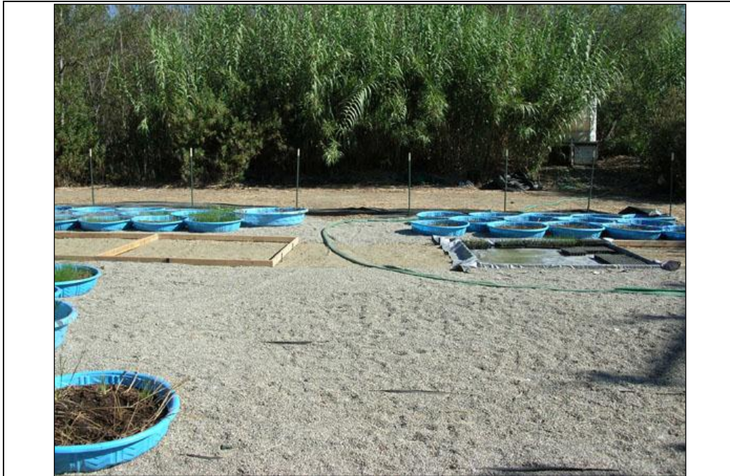
September 2007 – Setting up nursery; water tank in background in arundo (controlled in 2009).