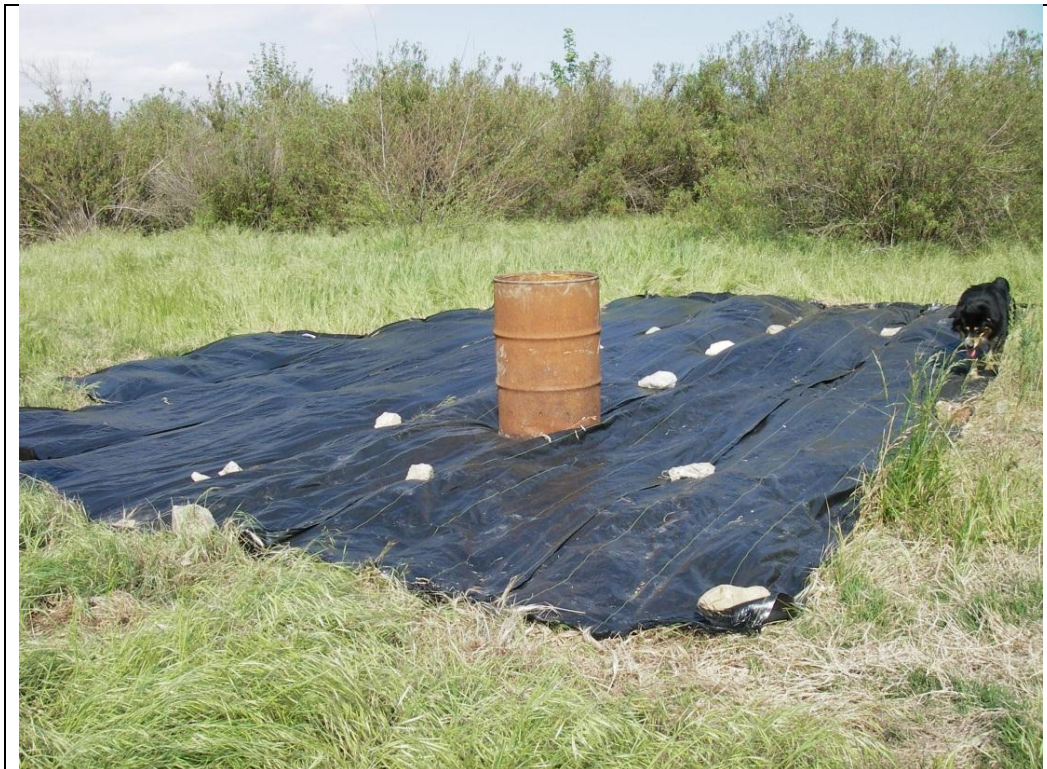
Solarization: Black plastic over perennial pepperweed ( Lepidium latifolium )