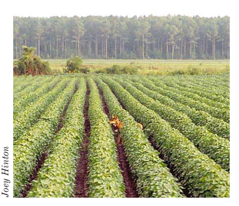
This is a juvenile male red wolf in a cotton field.

Howling is another significant form of communication and a means of maintaining territorial boundaries. Wolves howl for many reasons: to keep track of wolves within and between packs, to assemble pack members, to announce or defend a fresh kill, to unify the pack (group howl), or to mark a territory.