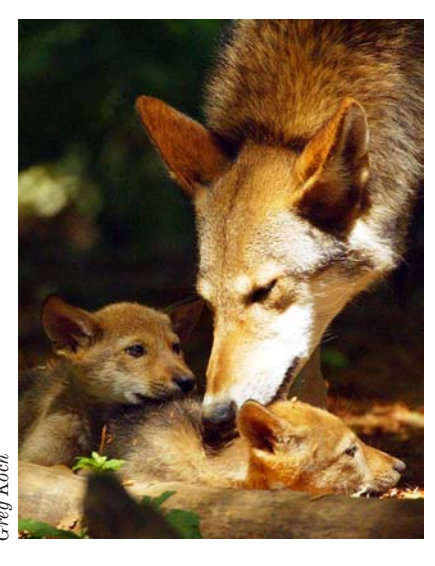
Red\ wolf\ dad\ and\ pups

Restoring red wolves contributes significantly to local economies. The presence of red wolves in the wild or in zoos and wildlife centers generates ecotourism dollars from those seeking to enhance their understanding of this endangered species. Howling Safaris, sponsored by the Red Wolf Coalition in cooperation with the Service, attract over 1,000 visitors annually to northeastern North Carolina and provide opportunities for red wolf education.