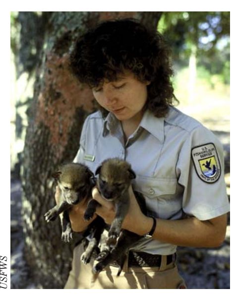
FWS biologist with new born pups

Although the exact diet of red wolves varies depending on available prey, a study of approximately 2,200 scats of wild red wolves from northeastern North Carolina estimates that their diet consists of about 50 percent white-tailed deer, 30 percent raccoons, and 20 percent small mammals, such as rabbits, rodents and nutria. A red wolf consumes about two to five pounds of food per day and can travel up to 20 miles a day in search of food.