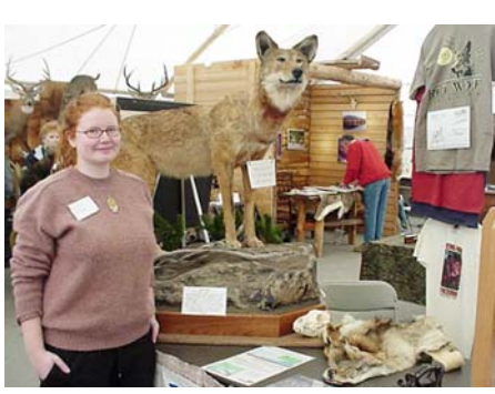
Eastern North Carolina Wildlife Art Show

Private/corporate lands are an integral component of the Red Wolf Recovery Program. They act as important wildlife corridors between federal lands and provide diverse habitats for wolves to occupy. Partnerships with private land owners work well for people and wolves.