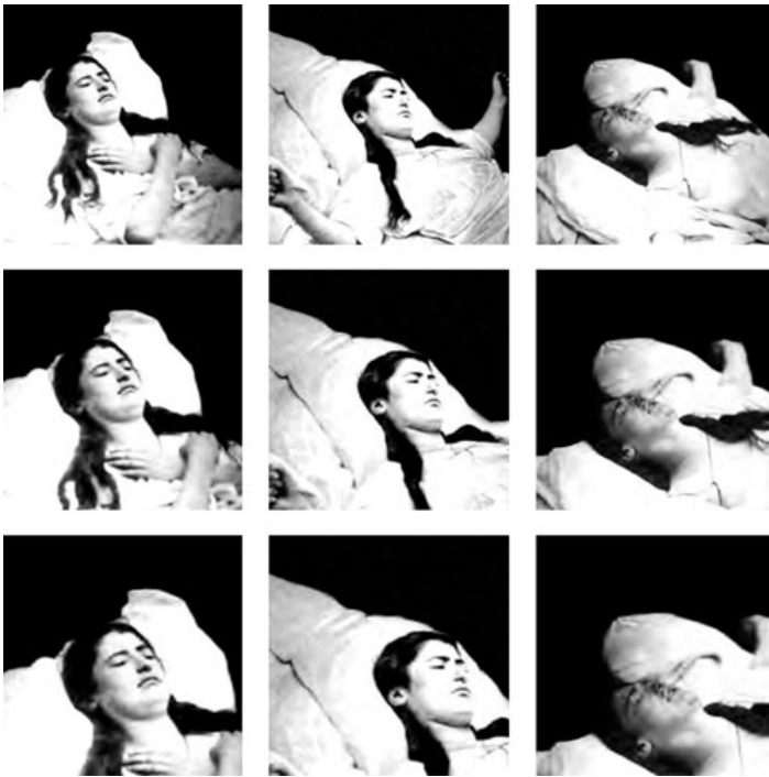
Jean Martin Charcot, Hysteria . Chronophotography from the book "Iconographie Photographique de la Salpêtrière," 1878.

Perhaps one could say, prima facie , that what Hegel and Freud have in common is that they both swear by science. For Hegel, one needn't look far: he published his first book, The Phenomenology of Spirit , as the first part of a more general work titled The System of Science ; his second book was called The Science of Logic ; his third book was Encyclopedia of the Philosophical Sciences . So "science" is conspicuously his master word. There is a thesis in this: any science worthy of its name should have a philosophical underpinning, and any philosophy worthy of its name should raise the claim to science, so that ultimately, philosophy and science should coincide in synonymy. For Freud, the science that he is after should by no means become philosophy and will only be able to maintain its scientific claims if it stays clear of