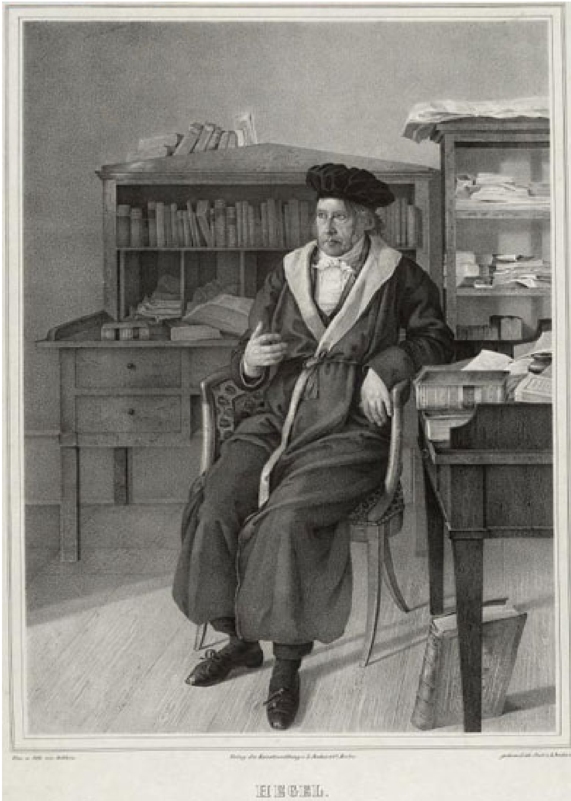
Ludwig Sebbers, Hegel at Age Fifty-Eight , 1828. Lithograph.