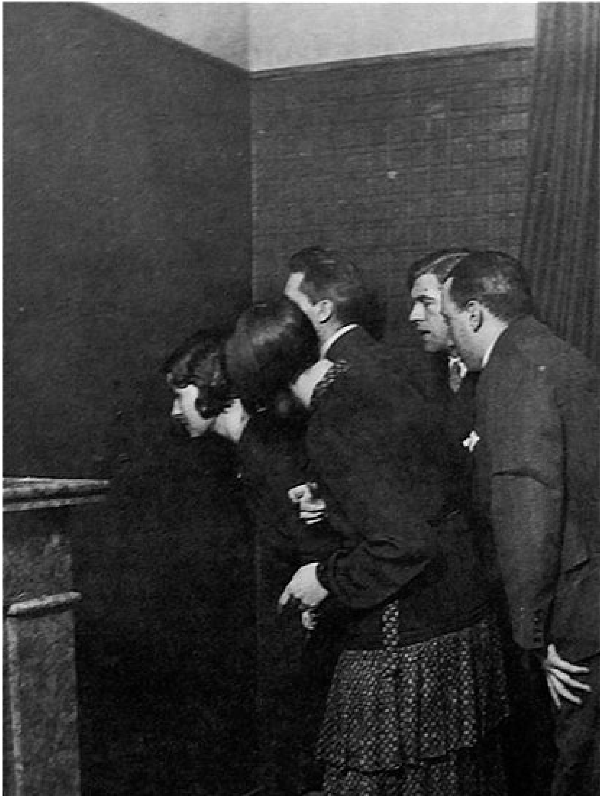
Paul Nougé, The Birth of the Object ( La Naissance de l'Objet ), 1929-30. Gelatin Silver Print.