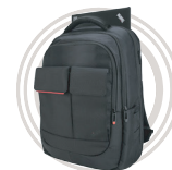
ThinkPad® Professional Backpack - Up to 15.6" PN: 4X40E77324