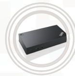
ThinkPad ThunderBolt Dock