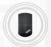
ThinkPad Precision Wireless Mouse