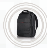
ThinkPad Professional Backpack