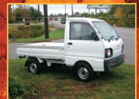
MITSUBISHI MINICAB UTILITY TRUCK