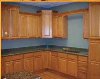
OAK CATHEDRAL TOP KITCHEN