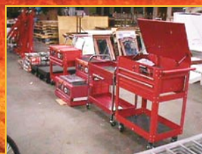
MECHANIC'S TOOLBOXES & CARTS