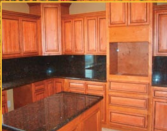
CHERRY CUSTOM KITCHEN