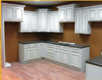
WHITE DESIGNER KITCHEN