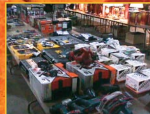
VIEW OF TOOLS

(100+) New DELTA Power Tools, you name it we have it! Drill Presses; Cutoff Saws; Tile Cutters; Light Bulbs; Linoleum; Lawn Mowers; Line Trimmers; Ceiling Fans; Roofing Shingles; Copper Wire; Lights; 7,500 W and 3,700 W Gas-Powered Generators; 1,700 PSI Power Washers; 2,400 PSI Gas Power Washers; 20-Gal. 5 Hp. Air Compressors; 2-Ton Pneumatic Engine Hoists; 12-Ton Shop Presses; Lots of Cordless Power Tools; 115V Stick Welders; COSCO Alum. Folding Ladders/Scaffolding; Mailboxes; 3- and 3-1/2-Ton Floor Jacks; FLO TECH Alum. Engine Headers; ATV Alum. Loading Ramps; Alum. Race Car Jack Stands; BLACK & DECKER Power Tools; Combo Sets; 18V and 24V Cordless Drills; Air Tanks; Elec. Radiator Heaters; Air Impact Tools and Sockets; STANLEY Tools; Eyeglass Display Stands; Brush Cutters; Levels; Clamps; Saw Blades; Laser Levels; Pipe Wrenches; Tool Chests; Oxy./Acty. Sets; Welding Supplies; 14" Abrasive Saws; Worm Drive Saws; Line Trimmers; Blowers; Chainsaw; Work Tables; Fluorescent Lights; 125 Amp Load Centers; Adjustable Shutters.