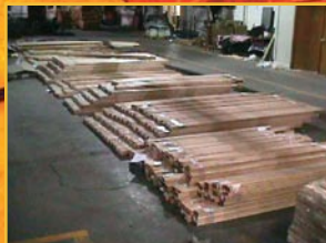
LG. QTY. HARDWOOD TRIM