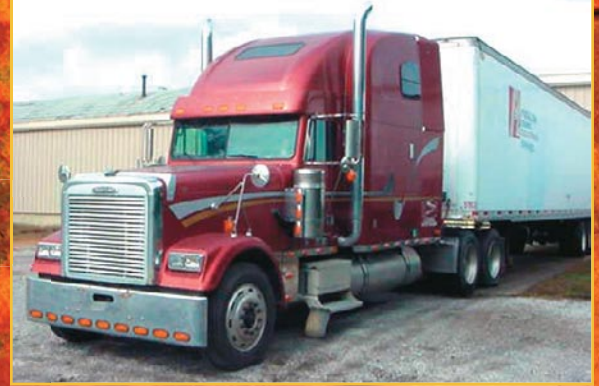
2001 FREIGHTLINER XL CLASSIC

2001 FREIGHTLINER XL Classic Semi Tractor, great tractor; 14' Self-Dumping Tandem Trailer; MITSUBISHI MiniCab Utility Truck, 3-cyl. gas, 6' drop side bed, great jobsite utility truck; 36 Hp. Estate Tractor; 1991 MERCEDES 300D, just serviced.