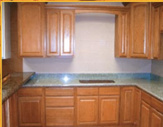
GOLDEN OAK KITCHEN