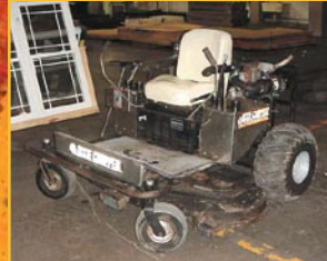
DIXIE CHOPPER 60" MOWER