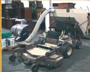
GRASSHOPPER 727 MOWER