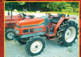
36 HP YANMAR TRACTOR, 1,900 HOURS