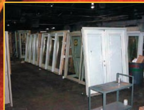
VIEW OF PATIO DOORS