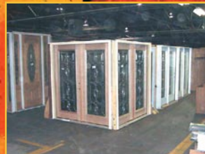
BEVELED GLASS ENTRY DOOR