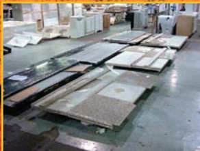
GRANITE COUNTERTOP SETS