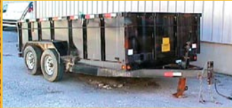
TANDEM SELF-DUMPING TRAILER

Sale Date: Saturday, November 1, 10:00 A.M.