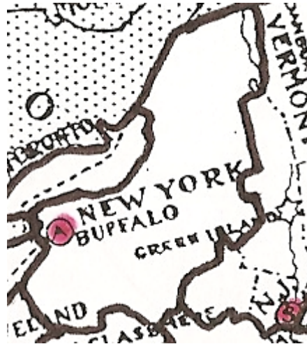
SALES AREA FOR FORD'S ASSEMBLY PLANT IN BUFFALO, NEW YORK FROM THE 1926 ISSUE OF FORD INDUSTRIES