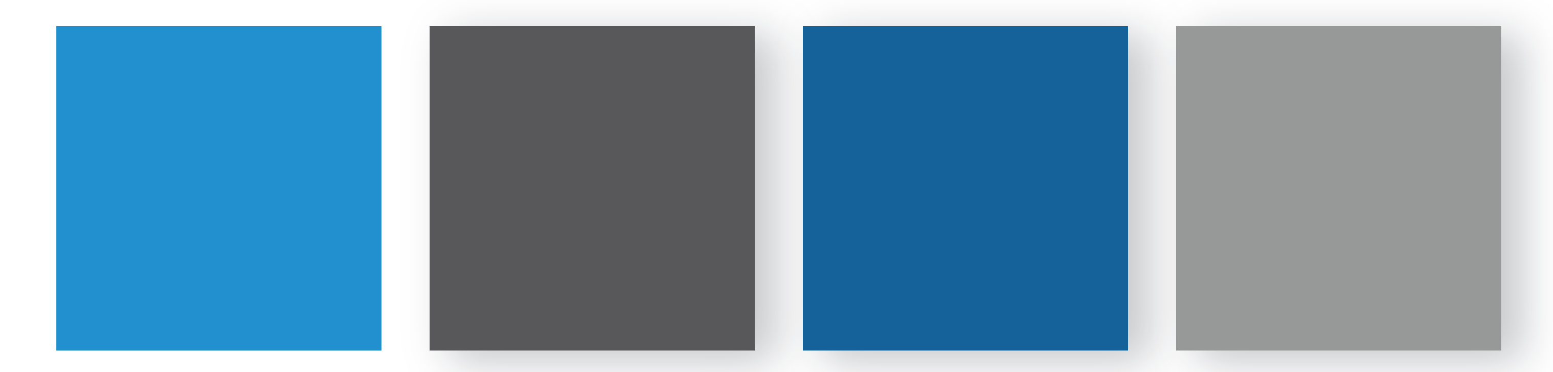
SKY HEX 0090D0 R 0 G 155 B 222 C 76 M 25 Y 0 K 0