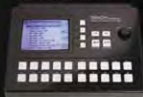
RC-F400S Hot Start Remote Controller