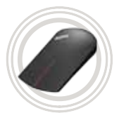
ThinkPad® X1 Wireless Touch Mouse

Wirelessly connect and expand the function of your device