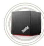
ThinkPad® WiGig Dock

Superior sound quality with a comfortable fit