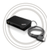
ThinkPad® OneLink Pro Dock

A special docking solution for ThinkPad®