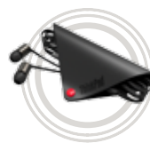
ThinkPad® X1 In Ear Headphones

A special docking solution for ThinkPad®