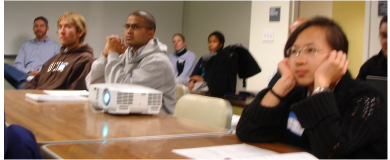
UC-Riverside students listen to the talk on Martis Creek Dam. The meeting was hosted by the University of California-Riverside Department of Geosciences and the Hewett Club.